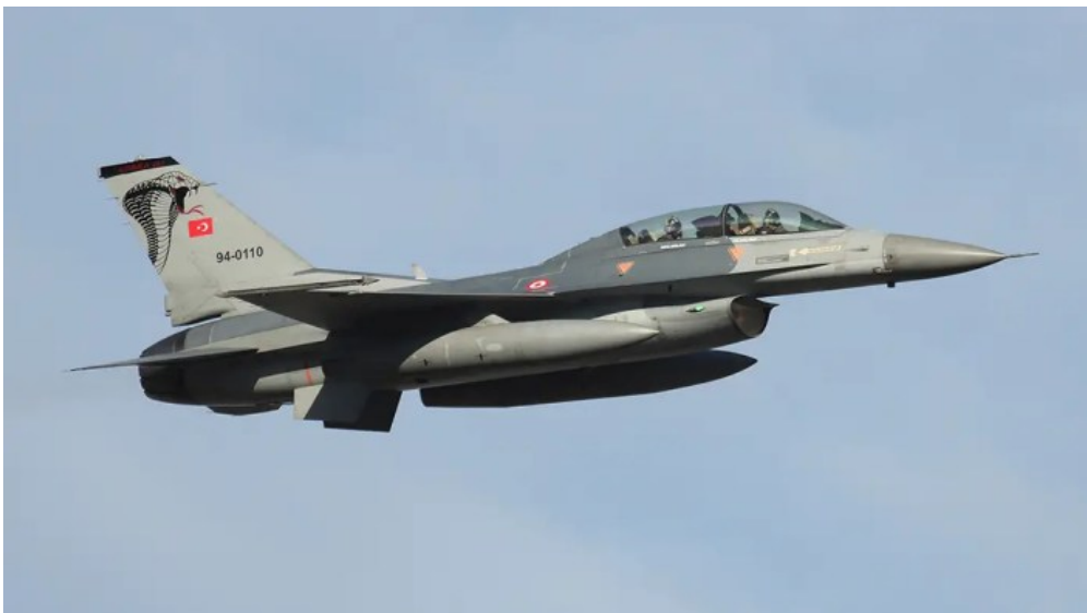
Turkish Air Force F-16.St

In particular, the Belgian, Turkish and Polish F-16s, along with the Czech Gripens and U.S. F-15E are deployed to Aviano AB, while Ghedi AB, home of the Italian Tornado fleet, hosts the Dutch F-16s and German Tornados.