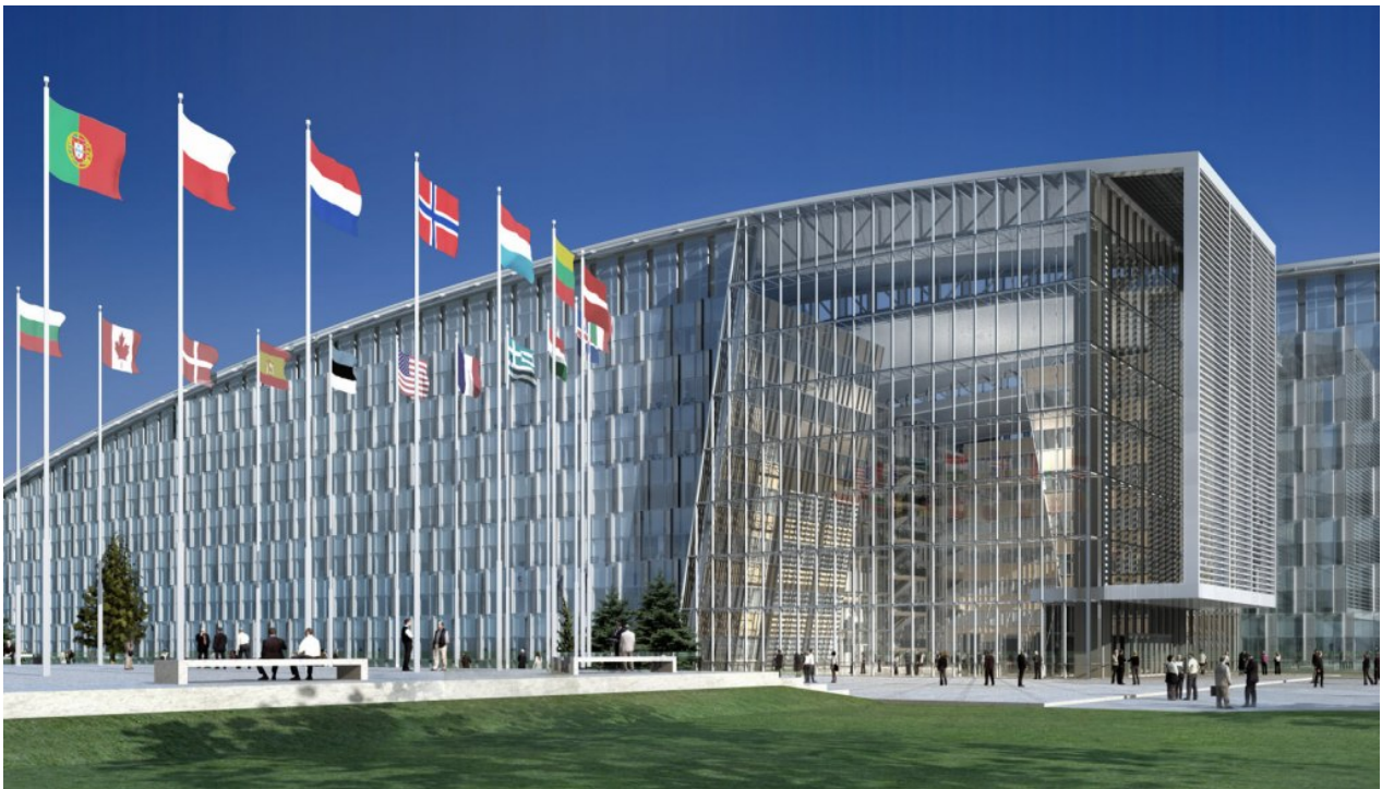
NATO's Mausoleum 2018

To learn more and find out how much you are not told when you listen to NATO's representatives and advocates arguing permanently for higher and higher contributions from all members. The relevant figures are here and here and here .