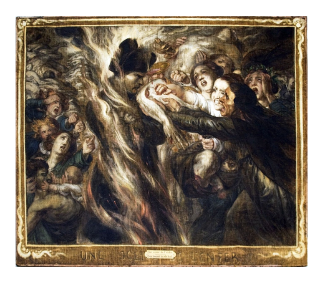
Antoine Wiertz, "Une scène de l'enfer", Wiertz Museum, Brussels

By substituting permanent warfare for permanent revolution within France, and above all in Paris, noted Marx and Engels, the Thermidorians and their successors "perfected" the strategy of terror, in other words, caused much more blood to flow than at the time of Robespierre's policy of terror. In any event, the exportation or externalization, by means of war, of the Thermidorian, (haut) bourgeois revolution, update of "1789", claimed many more victims than the Jacobin attempt to radicalize or internalize the revolution within France by means of la Terreur .