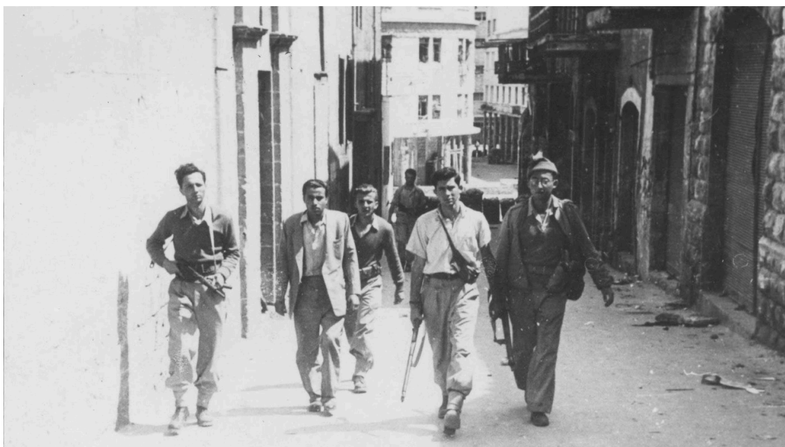
Jewish fighters in Haifa, 1948

Britain, which by then was coming under violent attack from the Zionist groups it had once propped up, declared it would leave by midnight on 14 May.