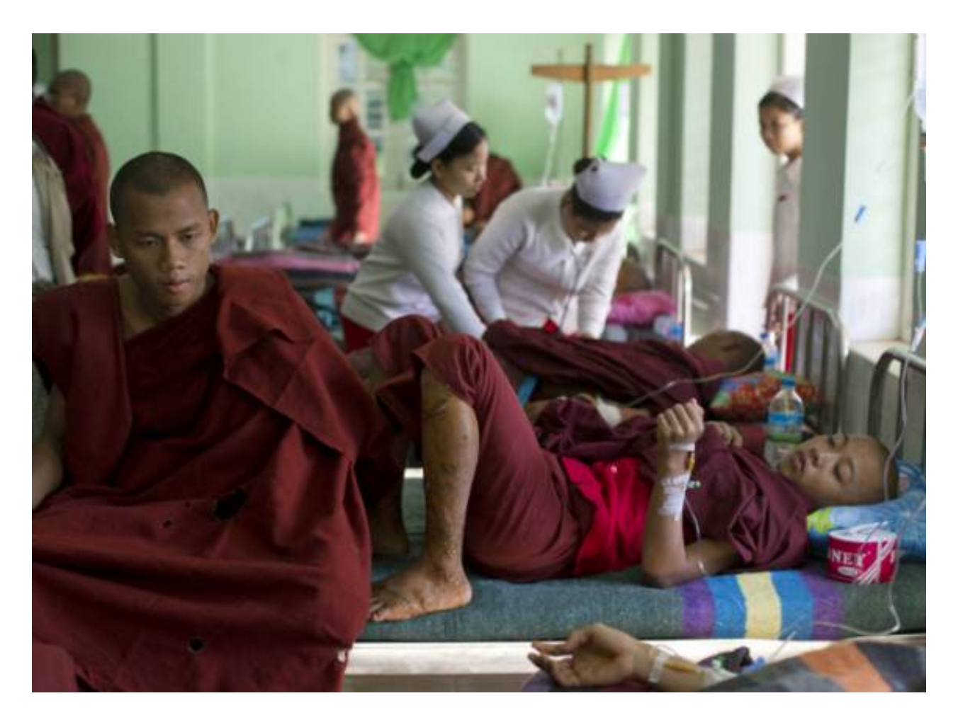
Image: The Western media gladly fills their coverage of the Monywa mine protest with images of battered, "victimized" "monks," while downplaying both the violence these same "monks" have visited upon Rohingya refugees in Rakhin state, as well as the indefensible silence of Aung San Suu Kyi regarding that violence.