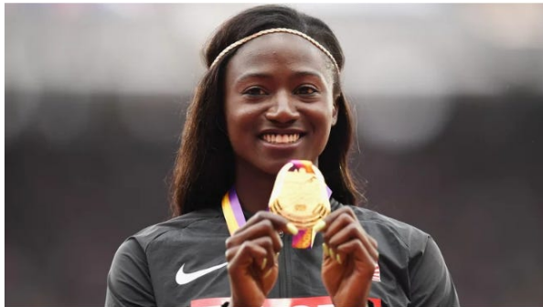
Tori Bowie, who captured gold as a sprinter in the Olympics and the world championships, died at age 32 from complications of childbirth, according to an autopsy report.