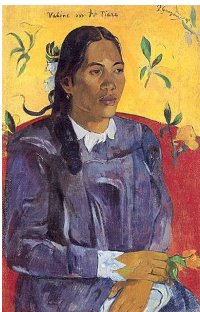
Image on the right: Paul Gauguin, Vahine no te tiare ( Woman with a Flower ), 1891, Ny Carlsberg Glyptotek