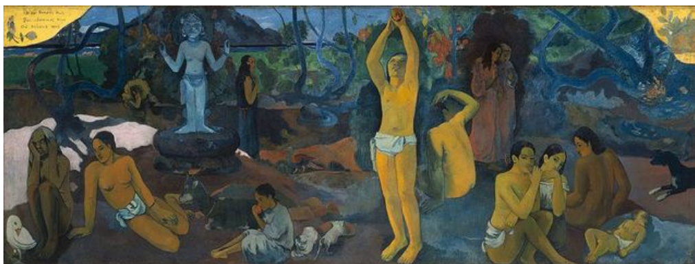
Paul Gauguin, Where Do We Come From? What Are We? Where Are We Going? , 1897-98

Paul and his mother eventually returned to France (his father having died en route to South America), living at first in Orléans in the house of an uncle then under police surveillance due to his role in the 1848 revolution.