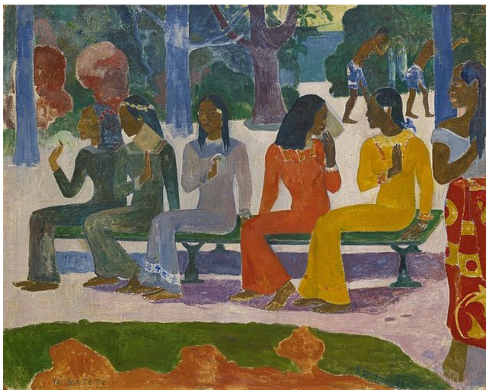
Paul Gauguin, Ta Matete , 1892, Kunstmuseum Basel

Upon receiving the news of the death “of their old enemy, the bishop and the brigadier of gendarmes—the pillars of the local [French] colonial regime—hastened to demonstrate their fatherly concern for the salvation of the sinner’s soul by having him buried in the sanctified ground of a Catholic cemetery. Only a small group of natives accompanied the body to the grave. There were no funeral speeches, and an inscription on the tombstone was denied to the late artist.” The bishop subsequently wrote in his regular report to Paris: “The only noteworthy event here has been the sudden death of a contemptible individual named Gauguin, a reputed artist but an enemy of God and everything that is decent.”