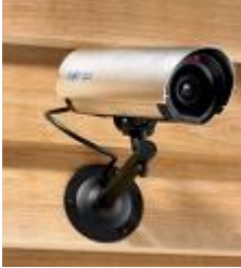
Britain: CCTV Surveillance into Thousands of British Homes - 2009-07-31