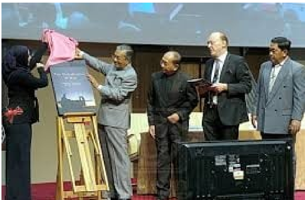
The 2015 Kuala Lumpur launching by Tun Dr. Mahathir Mohamad, PM of Malaysia of Michel Chossudovsky's book entitled The Globalization of War

The Worldwide Corona Crisis: Global Coup d'État against Humanity. (2022), E-Book pdf format. Print version forthcoming. Also published (print) in Japanese (2022)