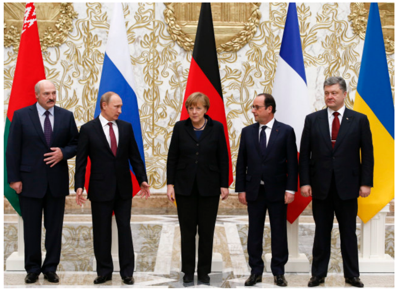
February 2015, Minsk 2 Agreement

In addition, after months of lies and denials, the US Department of Defense finally admitted having funded and built 46 military-grade (grade 3) bio-labs in Ukraine. See this.