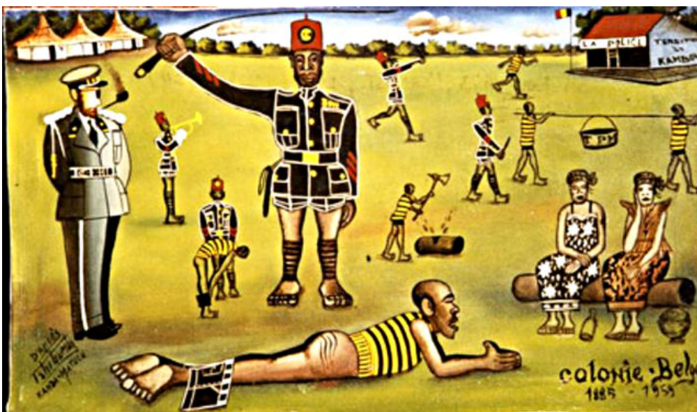
Belgium's crimes before Congo's independence (1885-1960)

One may consider it a certainty that the King of the Belgians, and the Congo Free State, which he governed with the agreement of the Belgian government and parliament of the time, are responsible for deliberate 'crimes against humanity'. These crimes are not blunders; they are the direct result of the