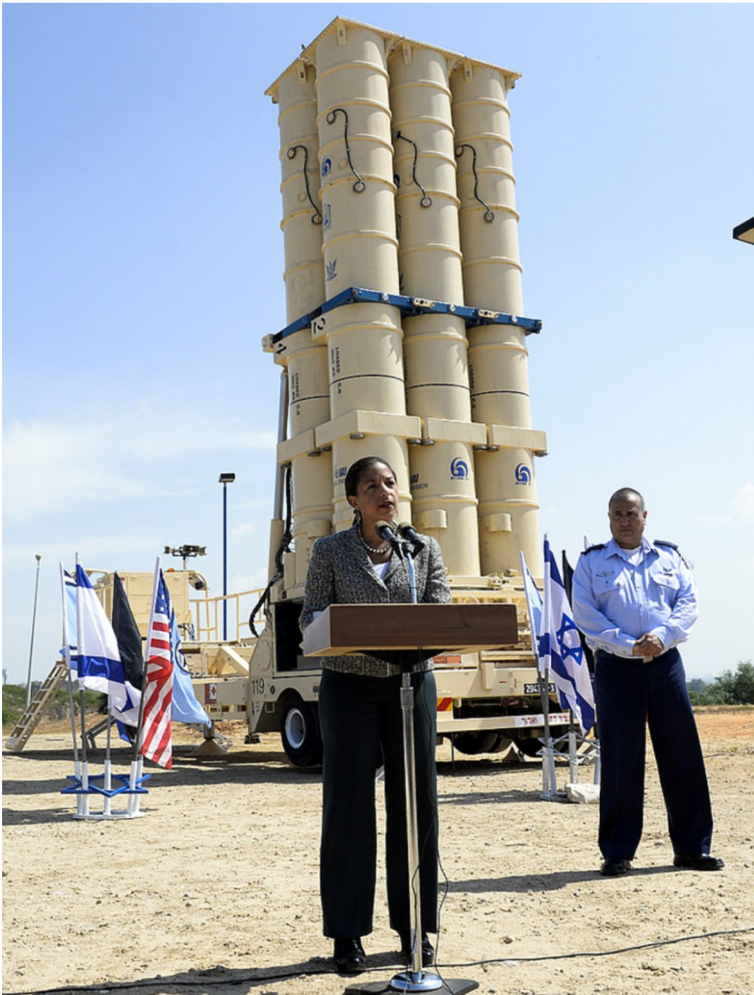
Ambassador Rice speaks in front of an Israeli missile battery in Tel Aviv during an 2014 visit to Israel.

Flournoy, meanwhile, was Under Secretary of Defense for Policy from 2009 to 2012 in the Obama administration under Secretaries Robert Gates and Leon Panetta. After “serving the country,” she received lucrative consulting contracts, joined corporate boards, and began her own security think tank, WestExec Advisors. By 2017, she was making a reported $452,000 annually.