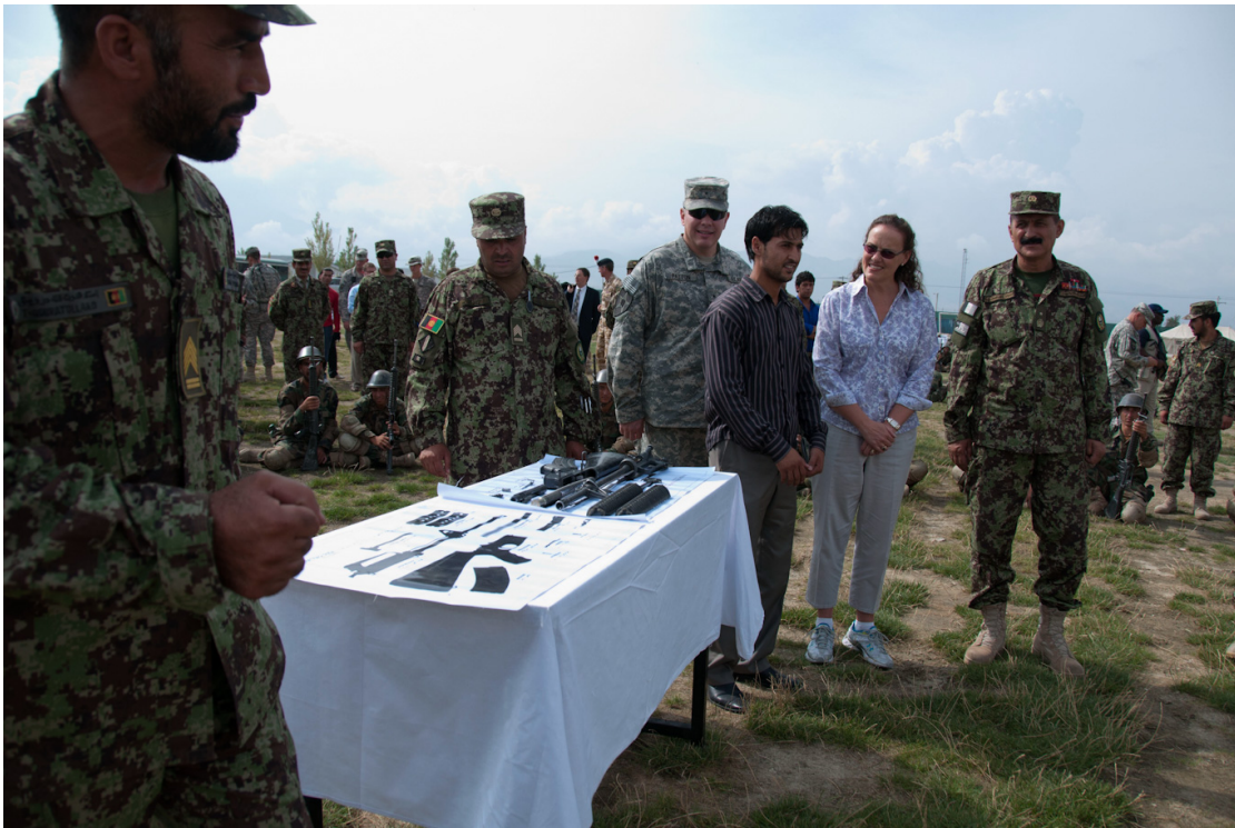
Flournoy meets with Afghan Army personnel during a tour of the Kabul Military Training Center Aug. 7, 2010.

Everett offered a similar analysis, suggesting that, with pro-Israel zealots like Rice advising him, the Biden administration would “expand” on what Trump had done in Palestine as well. Meanwhile, for Latin America, his foreign policy team intends to revive the so-called “anti-corruption drives” of the Obama era, which ultimately overthrew an elected government in Brazil and paved the way for the ascendancy of far-right figure Jair Bolsonaro.