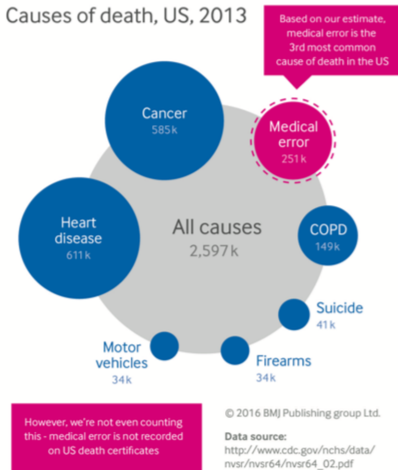
Fig 1 Most common causes of death in the United States, 2013 2

that medical error is the third most common cause of death in the US (fig 1).[2]