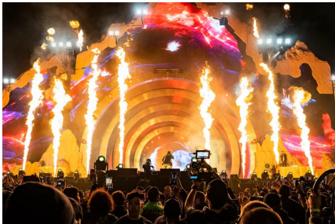
Travis Scott performs during 2021 Astroworld Festival.