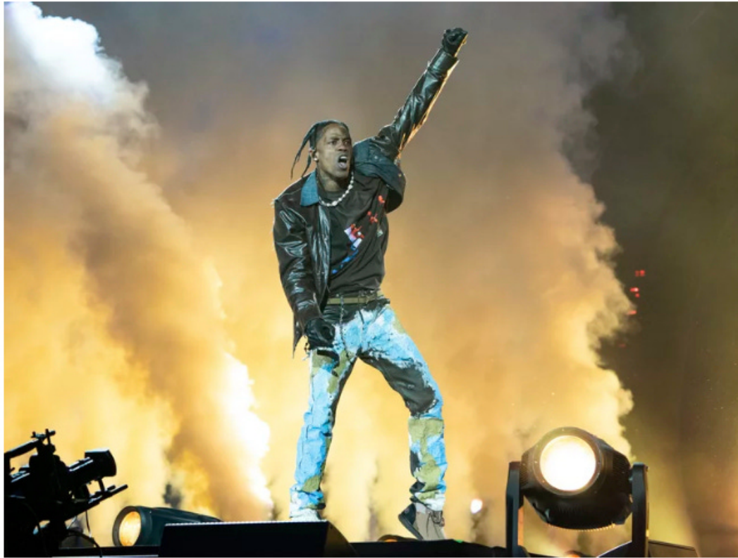
Travis Scott performs at the Astroworld Music Festival at NRG Park on Friday in Houston.