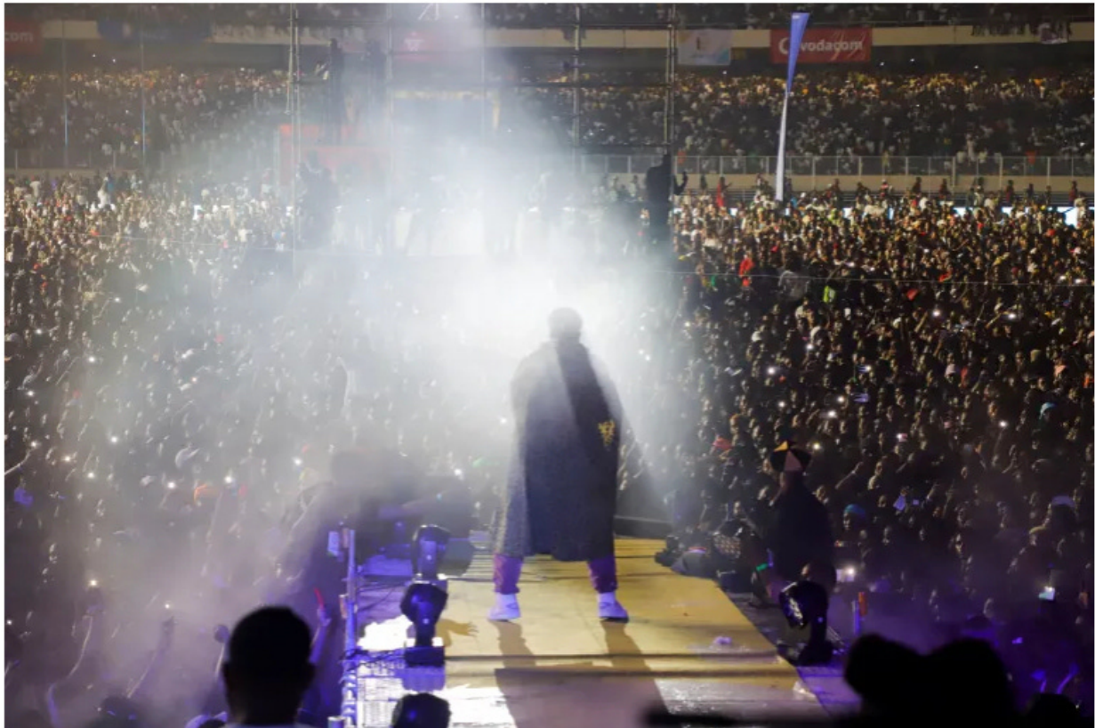
Congolese singer Fally Ipupa performs during his concert at the overcrowded Martyrs stadium in Kinshasa, Democratic Republic of the Congo, October 29, 2022

Interior minister blamed organisers for the packed concert headlined by African music star Fally Ipupa in Democratic Republic of the Congo.