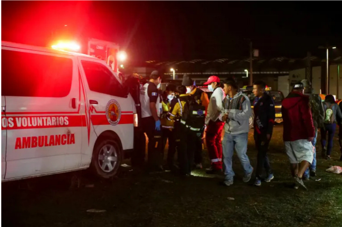
Paramedics and government officials stand at the scene following a deadly stampede at a concert to commemorate the country's Independence Day in Quetzaltenango, Guatemala, September 15

Emergency services say the victims died in a crush of people during an event celebrating the nation's independence.