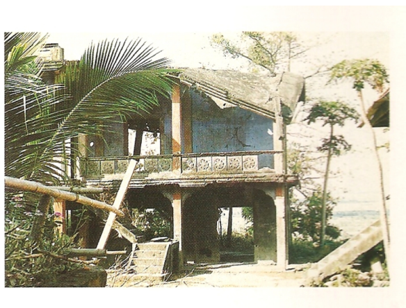
Local farmers at Phnom Chisor in 1988 pointed out what they said was 1973 U.S. bomb damage to the historic site's modern Buddhist wat, still unrepaired in 1988.

revised our tonnage figure downward. For example, on March 1, 2010, in response to our question about how they had derived their tonnage figures, High explained their procedures for each of the two Pentagon databases in turn.