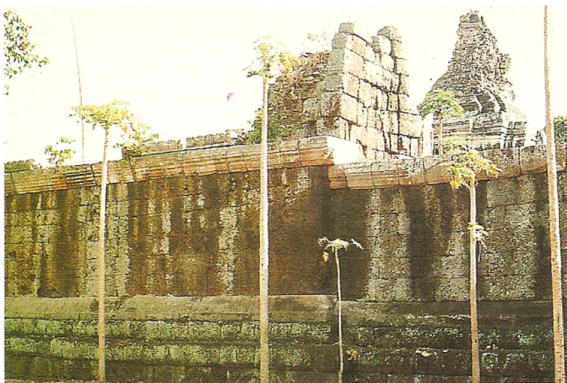
Angkor-era Khmer temple at Phnom Chisor, Takeo province, Cambodia.