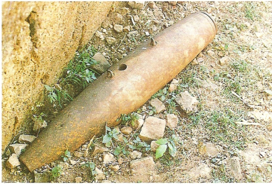
In 1988, farmers at Phnom Chisor pointed to an unexploded U.S. bomb still lying where it had fallen in 1973.

The complexity of this technical discussion should not obscure the fact that, whatever the precise U.S. bombing tonnage dropped on Cambodia, it was massive. And as we have documented in three studies, much of it fell indiscriminately on populated rural areas. The bombardment's humanitarian and political effects are clear. We stand by the conclusions we have published on these issues over many years of research: