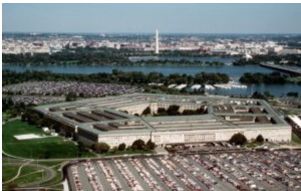
The Pentagon, headquarters of the U.S. Defense Department, as viewed with the Potomac River and Washington, D.C., in the background.

DB: One of the important points you make in the book is that, whatever any analyst has to say about who is likely to prevail, nuclear war means mutual destruction.