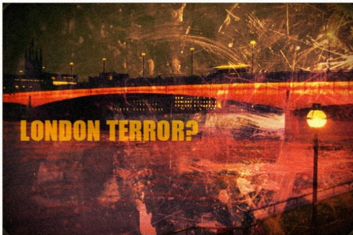
'LONDON TERROR' – What's truly behind this latest terror tragedy? (Photo Illustration 21WIRE's Shawn Helton)

The new London attacks, come on the heels of the UK's 2017 general election on June 8th, a race which has tightened dramatically since the Manchester Arena attack. Reuters reports the latest election details in the aftermath of yet another terror incident: