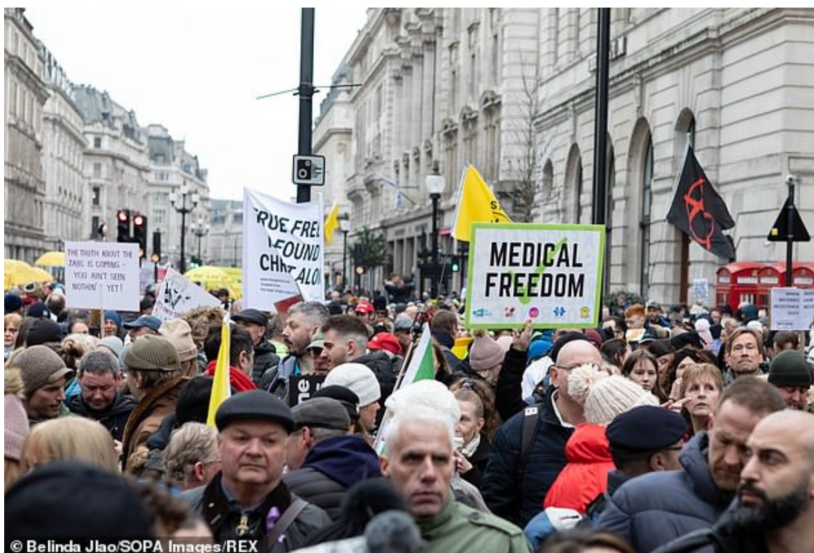
Protestors seen holding placards that say ‘medical freedom’ during a demonstration against vaccine mandates in the UK

‘The protocols of the RKI crisis team, some of which have now been released, raise considerable doubts as to whether the political measures to deal with the corona pandemic were really taken on a scientific basis.’