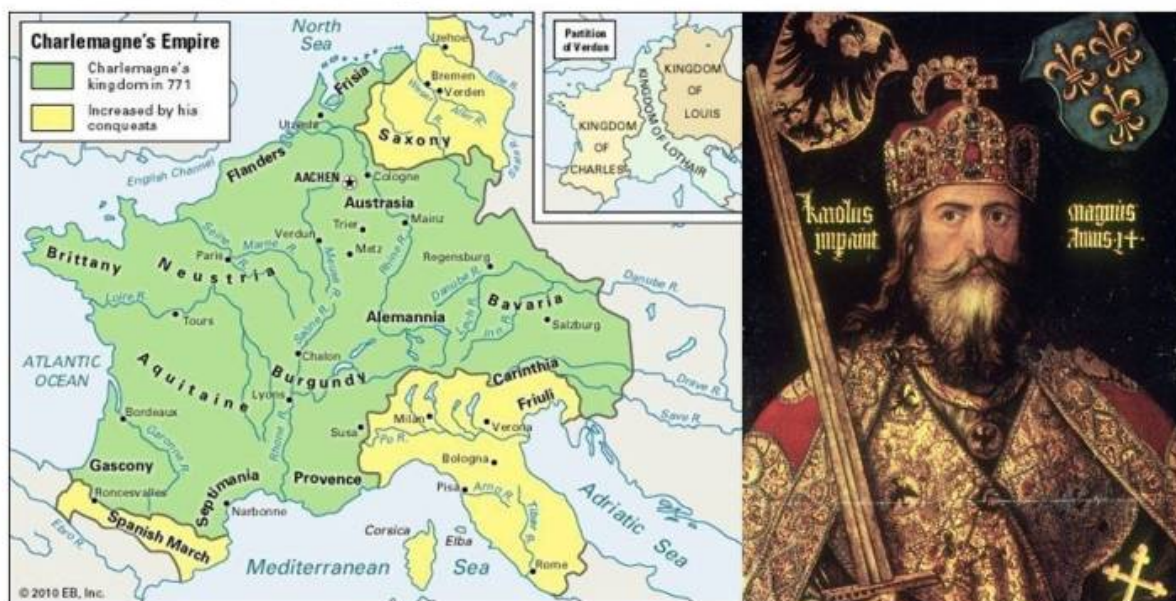
Charlemagne's Augustinian Revolution in Statecraft- Below featured Charlemagne's empire and it's balkanization by his three warring grandchildren via the Partition of Verdun

Among the most celebrated and widely transcribed books in Charlemagne's court were Augustine's City of God and On Christian Education which were read to Charlemagne extensively by the grand strategist Alcuin.