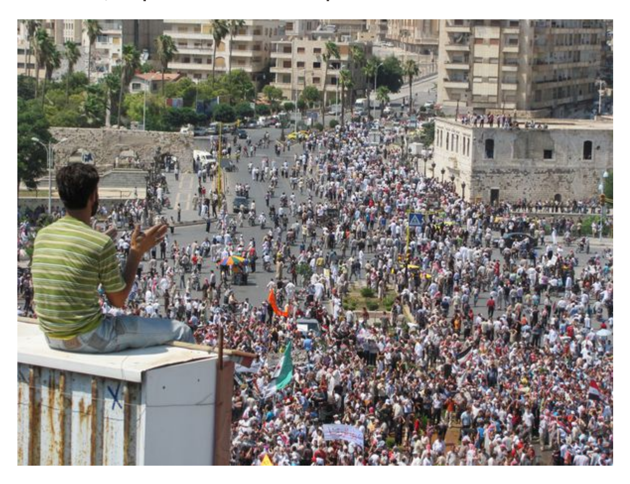
Hama - 500,000 protestors (AFP news reports) [1]

HAMA (July 15th, 2011)