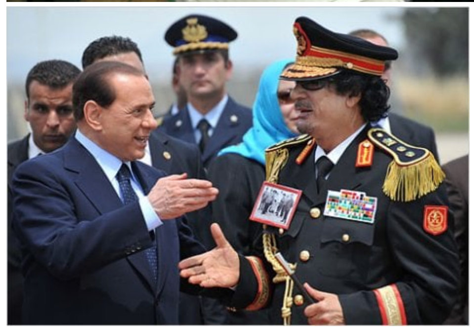
Rapprochement with Tripoli and Imperial Extortion

In late-2008, the U.S. government got Tripoli to pay what was tantamount to an "imperial