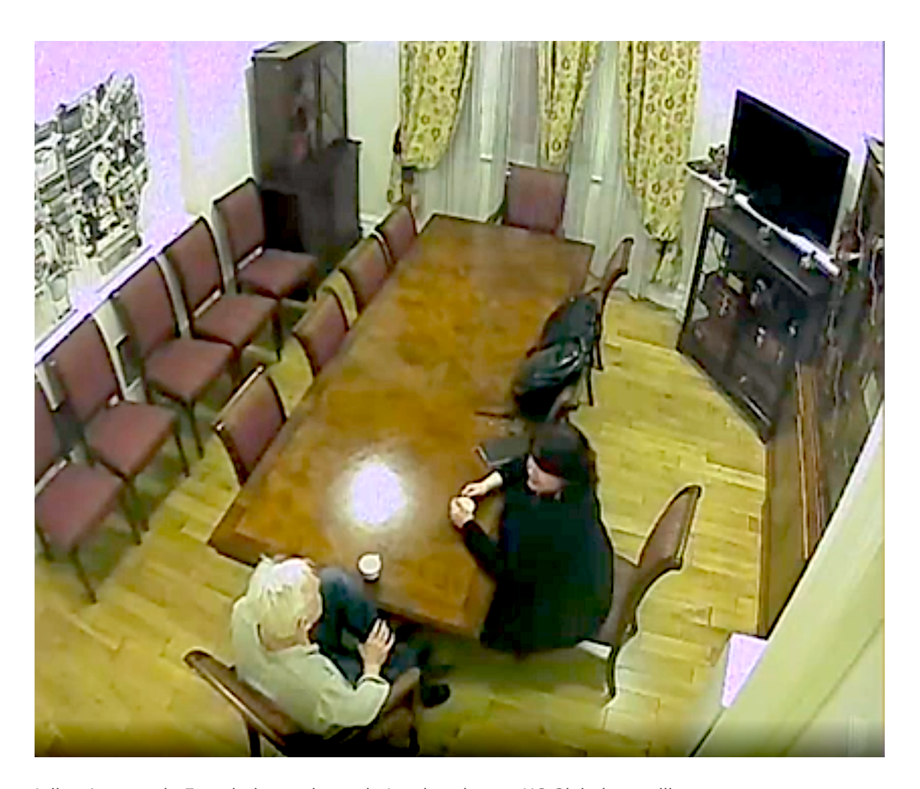
Julian Assange in Ecuadorian embassy in London shot on UC Global surveillance tape.

The way it was done was certainly a mistake, but one made, as Baraitser says, for understandable human reasons, and clearly intended as a temporary measure to protect the privacy of the family until the moment came for full disclosure to the Court. This took place at a bail hearing in April 2020, months before the substantive hearing before Baraitser in the autumn of that year, and months before the U.S. filed its second superseding indictment, which was the indictment actually before the Court when the case was tried.