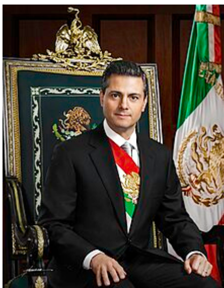
Mexican President Enrique Peña Nieto

It's also about political and economic war on Russia, Cold War 2.0, risking things turning hot, the most dangerous time in memory, neocons infesting Washington playing with fire, media reports throwing fuel on it.