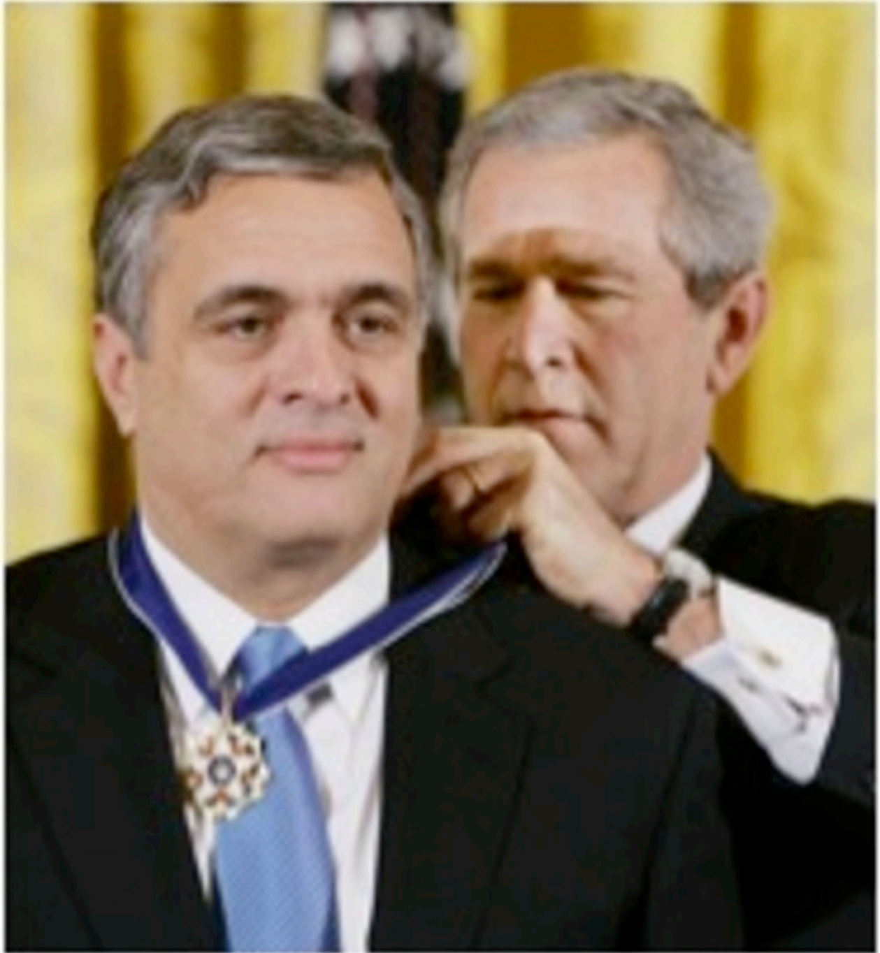
President Bush awarding National Medal of Honor to George Tenet, Dec. 14, 200