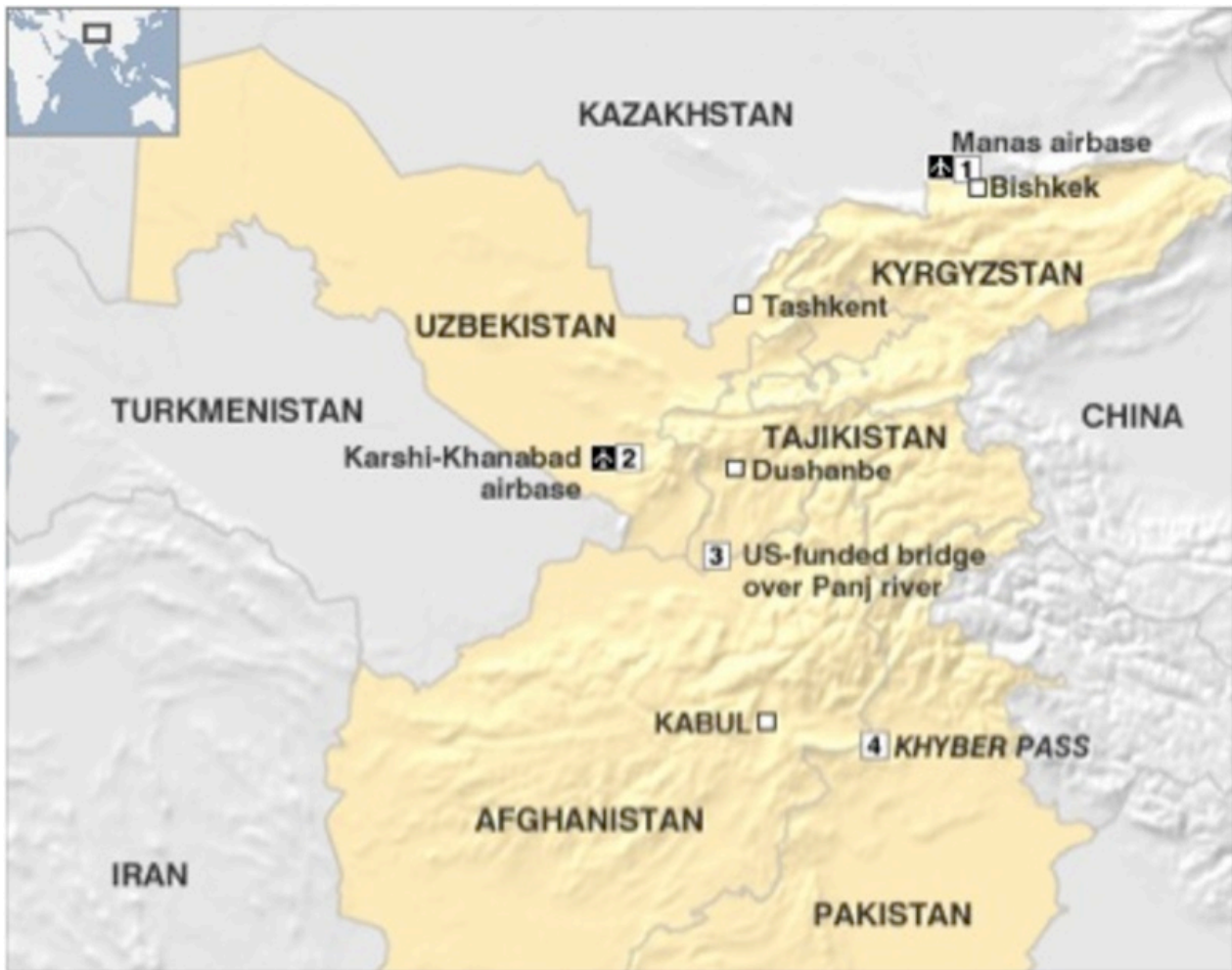
Map showing US bases including Karshi-Khanabad

A third anomaly is that the Terror War led to a dramatic increase in the resort to terror, and even torture, by America itself, including against its own citizens. In this context it is relevant that Cheney and Rumsfeld, through their participation in the Defense Department's super-secret Doomsday Project, had also been part of Continuity of Government (COG) planning for undermining the U.S. Bill of Rights by the warrantless surveillance and detention of dissenters. 26 These plans, dating back to the fear of Communists in the McCarthyite 1950s, have been the underpinnings for the elaborate plans in the Pentagon and elsewhere for dealing with antiwar protests against the Pentagon's plans for global domination.