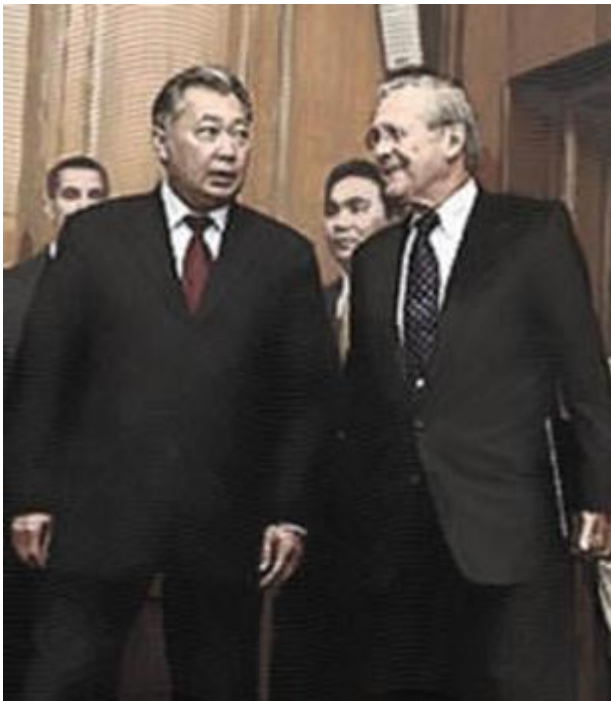
Bakiyev and Rumsfeld