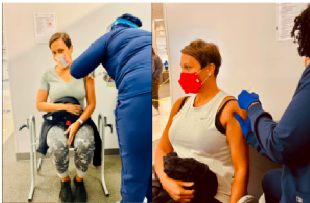
Left is the second shot from April 2. Right is the first shot in March.

Last month, then this week. Two doses of a corona virus vaccine to start 2021. 🤔 And in about 10 days, when I'm fully vaxxed, you can "catch me outside". 😊 Seriously, even when I'm "fully vaccinated", I still plan to wear a mask in most public places, continue to wash my hands diligently & often, and social distance especially* around people I don't know. But it's good to have a choice. If you're undecided about getting a vaccine, maybe this will help you make a decision. I was in & out in less than an hour both days, the needle stung just a little, and I had no side effects. I'm still looking for any that might pop up, but so far nothing. I'm excited to get together with my other friends who've had their shots, I'm excited to travel again, and definitely excited about being out & about and not fearing I'm gonna get sick just because someone coughs in the same room. This pandemic is not yet over, but getting the vaccine will certainly move it closer to an end. If you have any questions, I'm happy to answer them for you.