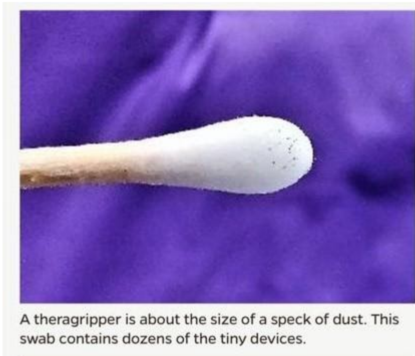
Figure 2: Theragrippers on a cotton swab

The Johns Hopkins University research team published positive results from an animal study as a cover article in Science Advances on October 28, 2020 [5], confirming that the new technology works flawlessly: