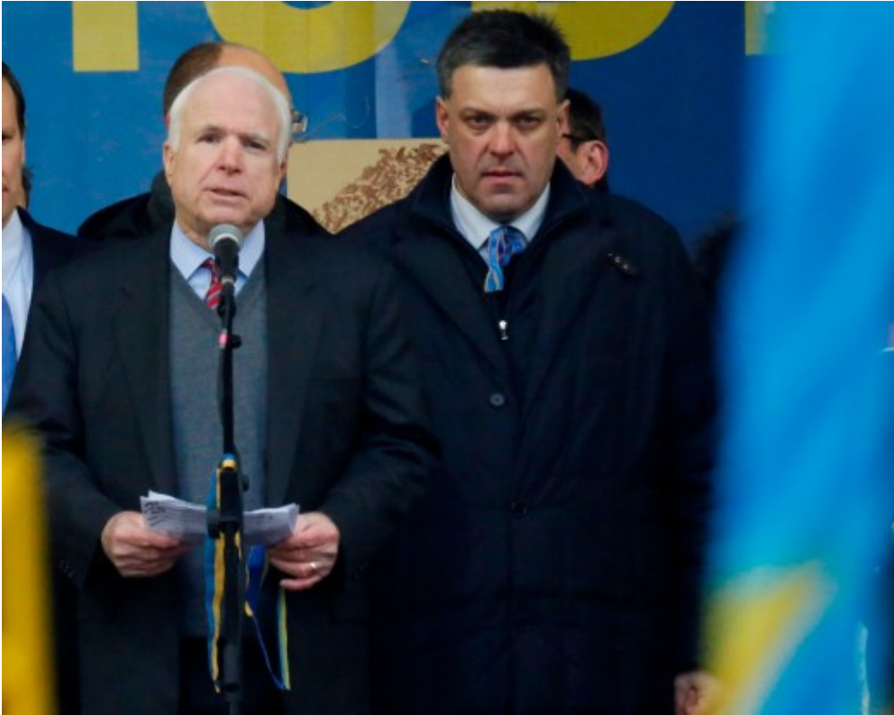
Senator John McCain (AZ) shares the stage in Kiev with far-right, NeoNazi Right Sector strongman, Oleg Tyhanbock, ahead of violent street protests in Ukraine in December of 2013, in advance of the US-backed coup.

Looking back at his erratic and flippant behavior, attacking nearly anyone who even suggested détente with Russia or that supplying lethal arms to militants in Syria was a bad idea, it's no surprise that cognizant onlookers have questioned whether or not McCain is in a normal frame of mind.