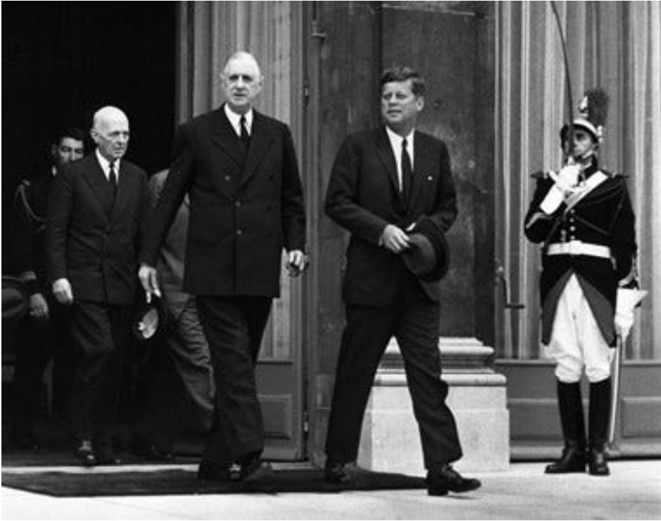
JFK and de Gaulle at the Champs Elysee in 1961

De Gaulle was not only successful at taking France out of the NATO cage in 1966[4], but he had organized to ensure Algeria's independence against the will of the entire deep state of France who often worked with Dulles' State Department to preserve France's colonial possessions.