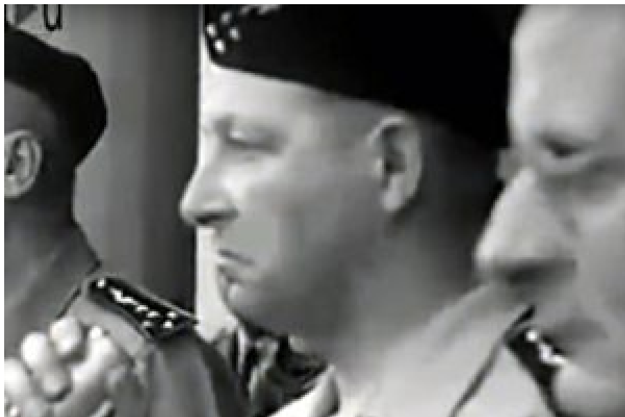
Général Maurice Challe

News that the coup was being led by the widely admired Maurice Challe, a former air force chief and commander of French forces in Algeria, stunned the government in Paris, from de Gaulle down.