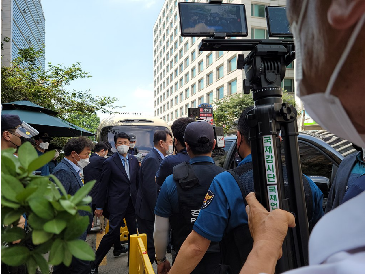
Yoon Suk Yeol leaving the People Power Party (PPP) headquarters shortly after joining the party on 30 July 2021 (Licensed under CC BY 4.0)

The PJCSK was formed during the Japanese colonial era (1910-1945). Korea was annexed to Japan in 1910 due to the treason of pro-Japan politicians led by the traitor, Lee Wan Yong.