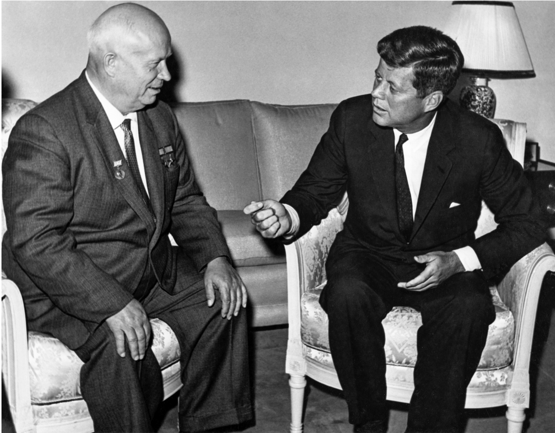
John F. Kennedy meeting with Nikita Khrushchev in Vienna.