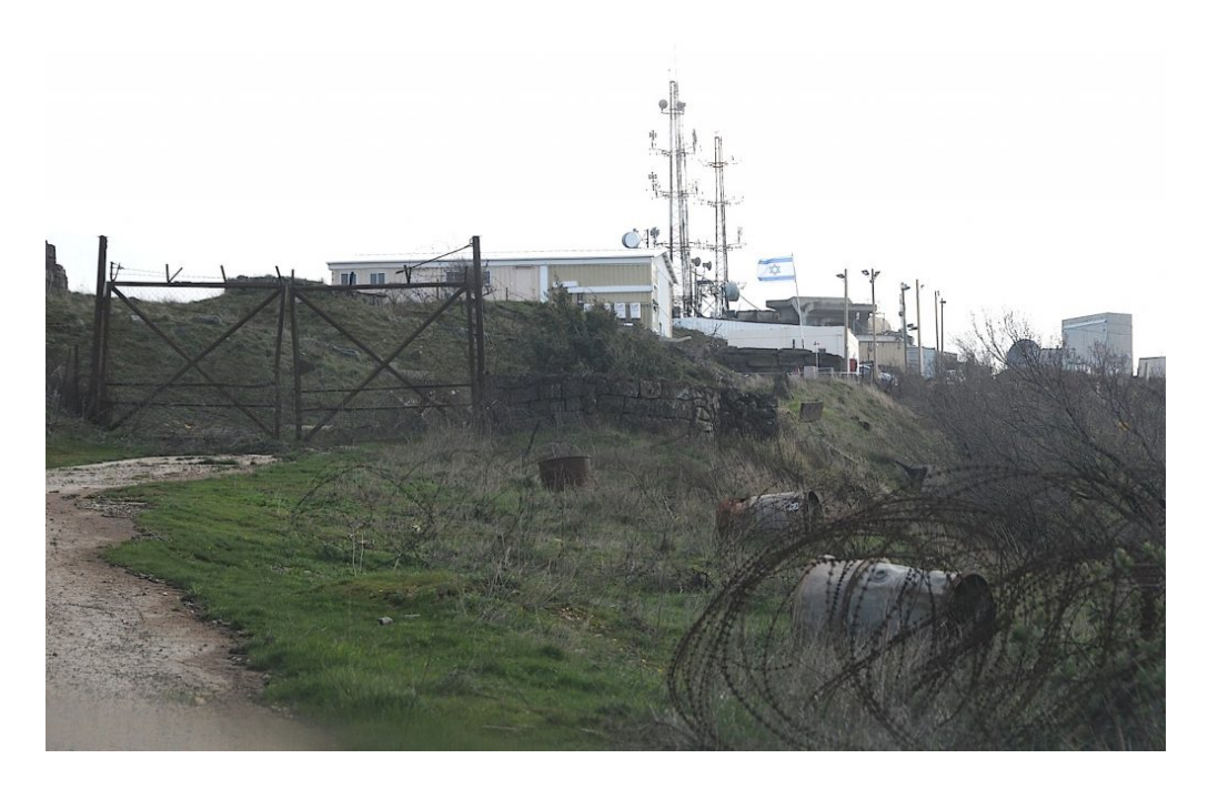
Spy - surveillance base on the hill overlooking Syria

But it is Israel which now has the right to 'worry' and to murder people in the name of its 'security'. That is precisely what the tone of the Western mainstream periodicals clearly suggests.