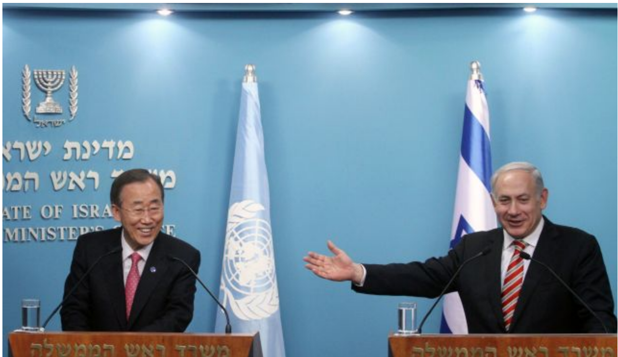
Image: Ban Ki Moon and Benjamin Netanyahu in Jerusalem.

Haaretz in their report titled, " UN chief angered over Netanyahu's 'leak' of private talk on Iran, sources say ," claims, "United Nations Secretary General Ban Ki Moon has been angered over what he considered to be Prime Minister Benjamin Netanyahu's "leaking" of the contents of a phone conversation between the two regarding the UN chief's planned visit to Tehran."