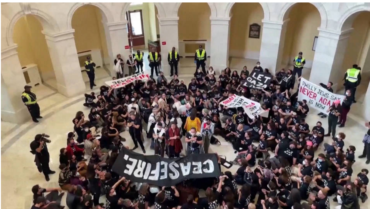
Jews demanding for ceasefire in The Capitol

Be it noted though that there are many thousands, maybe hundreds of thousands of Jews in Israel and around the world, who do not agree with this murderous onslaught demonstrated by their Israeli leadership against Gaza. Thousands of them protested over the past weekend in Jerusalem and capital cities around the world, against Netanyahu’s merciless war policies.