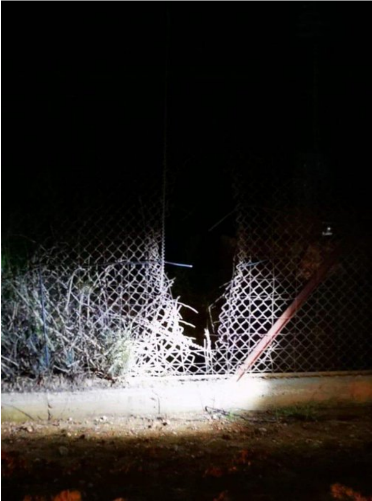
One of the three locations on the Lebanese borders where the fence has been cut, indicating a possible crossing.

Hezbollah, which has not yet officially declared responsibility for the operation, refrained from commenting. However, the following day, Israel found three breaches of its border fence cut in three different locations that fall under the responsibility of three different Israeli battalions on the border with Lebanon. Also, three closed blue bags with electrical wires inside were left on the other side of the fences for the Israeli to find them.