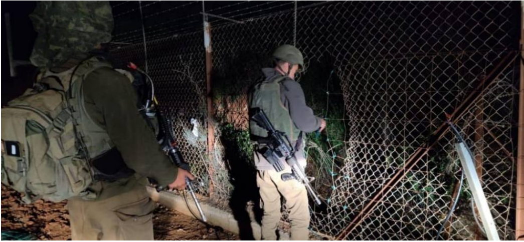
Israeli soldiers repairing a fence at the borders with Lebanon

Indeed, after his return from a visit to Washington, Israeli Defence Minister Naftali Bennett admitted that “Israel hits a Hezbollah truck loaded with weapons and leaves five trucks without intercepting them.” This indicates that Israel is aware it has failed to reduce the capabilities of Hezbollah and to prevent the supply of advanced weapons and precision missiles. Israel wishes to permanently eliminate Hezbollah and is still working hard to do so, but without finding a way to break the “deterrence equation” imposed on it by Secretary-General Hassan Nasrallah, and without triggering a wider conflict which Israel is not ready for.