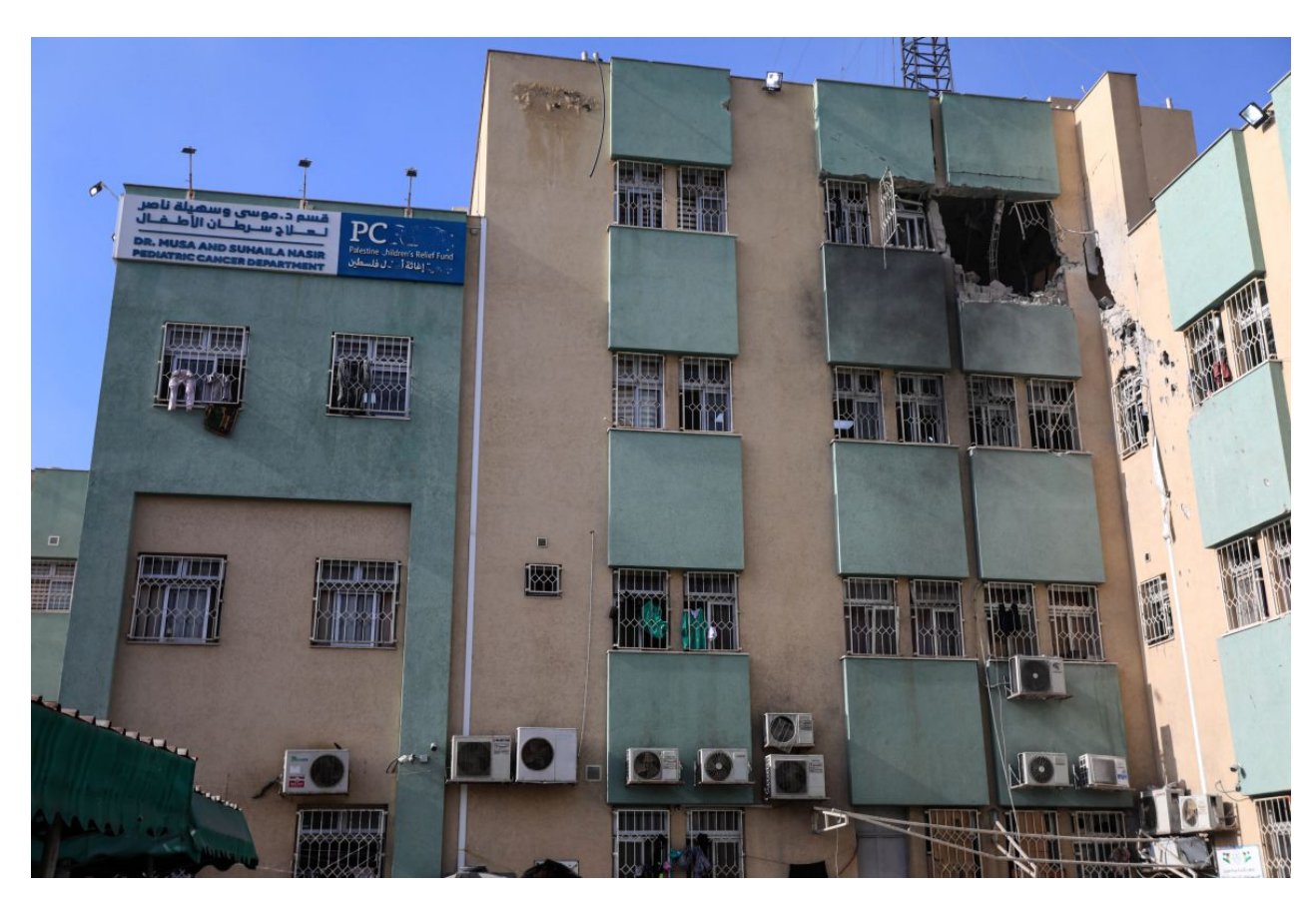
On November 6, Israeli air attacks hit the grounds of the Rantisi Specialist Hospital where displaced families have taken shelter and ambulances are parked.