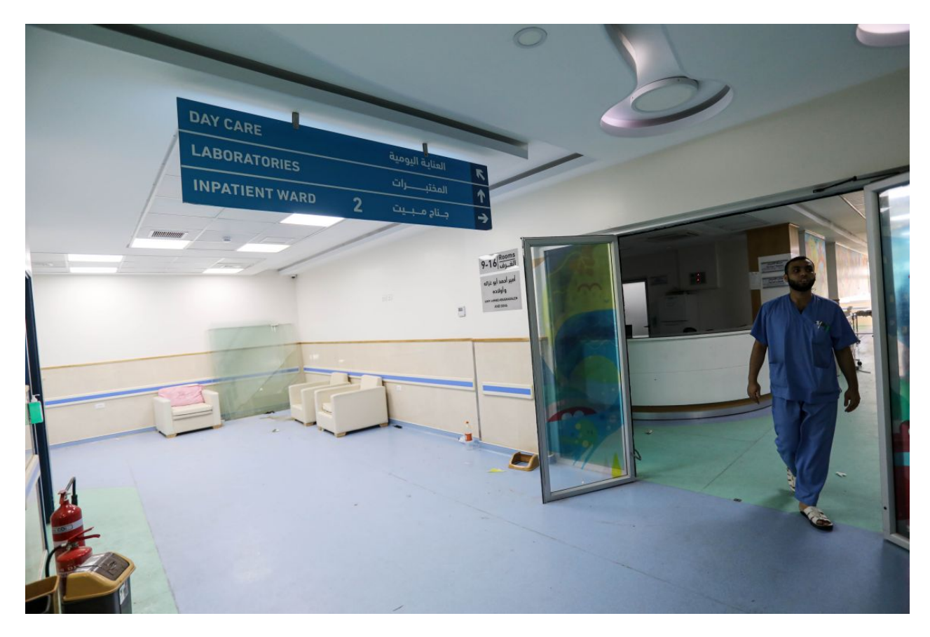
Since October 7, the Israeli offensive has put at least 16 of Gaza's 35 hospitals out of service.