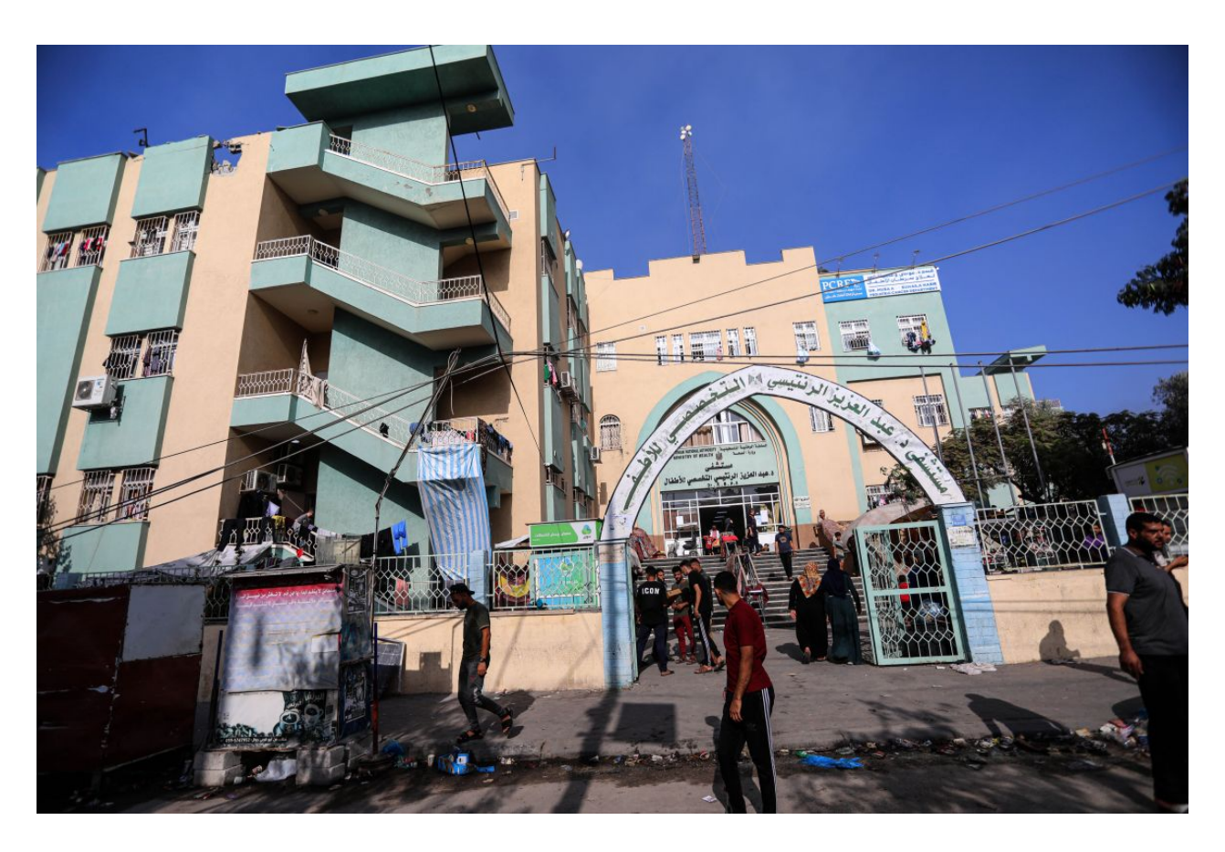
The Nasser Medical Complex contains the Al-Nasser Children's Hospital, the Rantisi Specialised Hospital, the Eye Hospital and the Psychiatric Hospital.