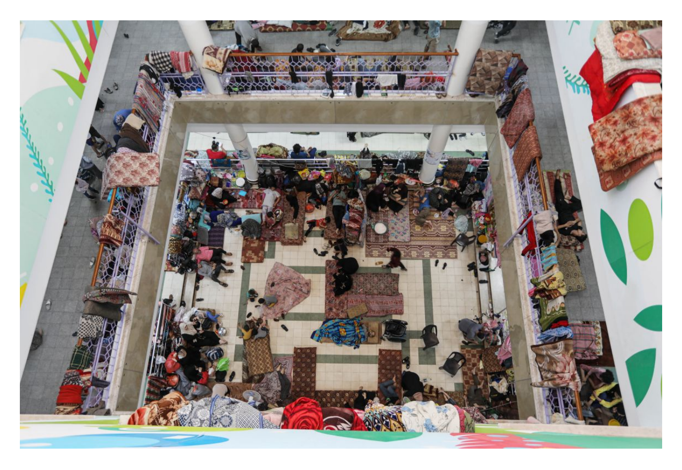
In addition to treating between 80 and 100 patients, the Rantisi hospital is also hosting some 700 families who have been displaced from their homes.