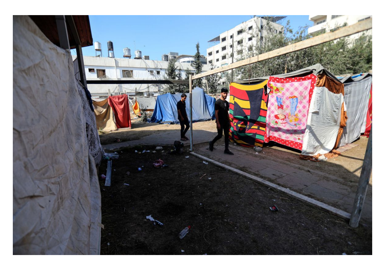
The Psychiatric Hospital treats between 50 and 70 patients per day, including those who have been left traumatised by the Israeli bombardment of Gaza.