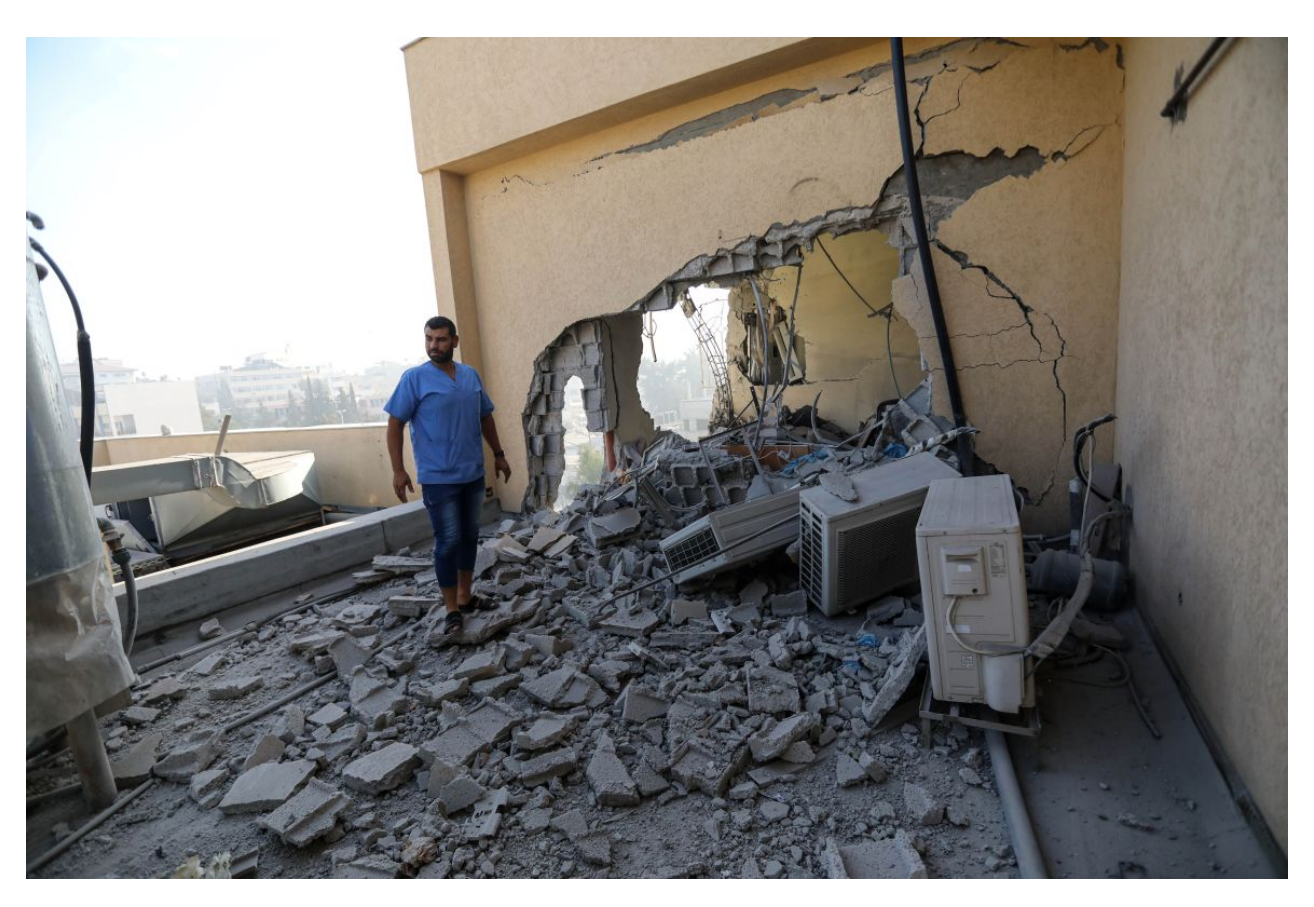
A nurse inspects the rooftop of the Rantisi Specialist Hospital for children, which was hit three times along with its solar panels and water tanks.