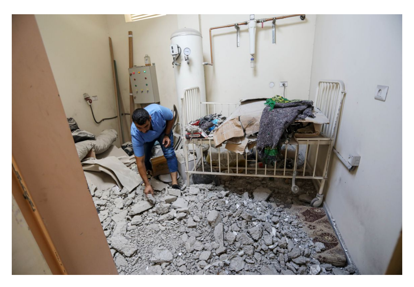
The children's cancer ward in the Rantisi hospital was damaged by Israeli missiles.