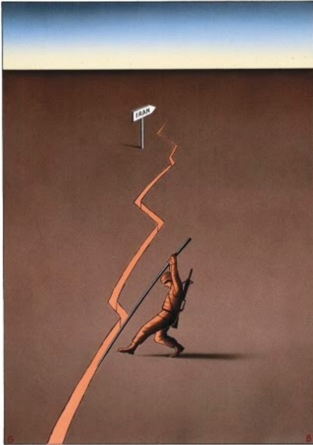
Image: From Seymour Hersh's New Yorker article, " The Redirection ," explaining in 2007 how the US planned to use a terrorist army to divide, destroy, and reorder the Middle East.

Before the inception of ISIS by the Western media, and as far back as 2007, Pulitzer Prize-winning veteran journalist Seymour Hersh would portend the creation of just such a terror group in his 9-page report in the New Yorker titled, " The Redirection Is the Administration's new policy benefitting our enemies in the war on terrorism? " He stated that (emphasis added):