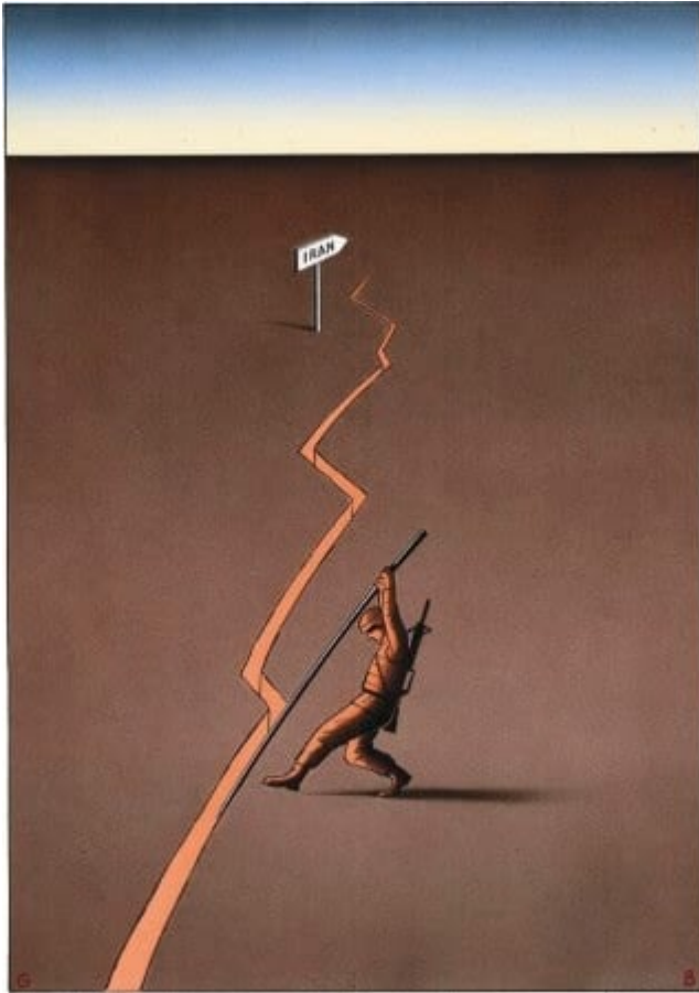
Image: From Seymour Hersh's New Yorker article, " The Redirection ," explaining in 2007 how the US planned to use a terrorist army to divide, destroy, and reorder the Middle East.

Before the inception of ISIS by the Western media, and as far back as 2007, Pulitzer Prize-winning veteran journalist Seymour Hersh would portend the creation of just such a terror group in his 9-page report in the New Yorker titled, " The Redirection Is the Administration's new policy benefitting our enemies in the war on terrorism? " He stated that (emphasis added):