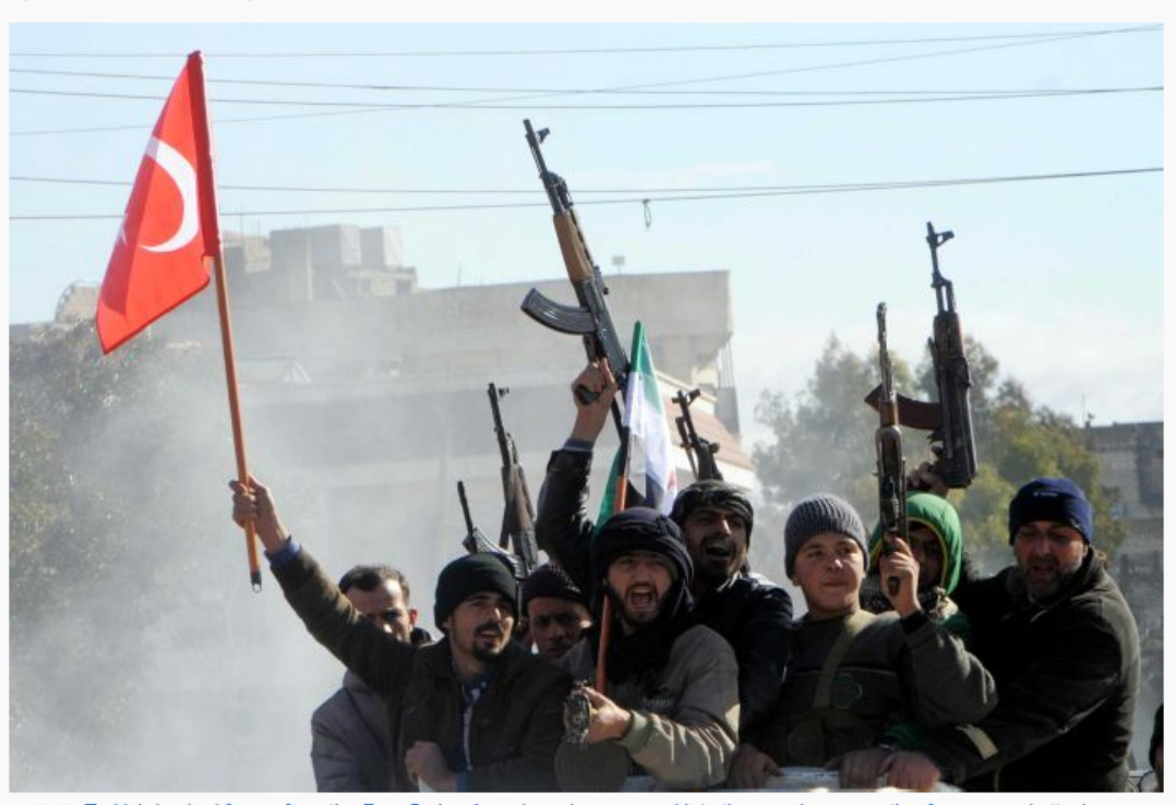
PHOTO: Turkish-backed forces from the Free Syrian Army have been moved into the area in preparation for a ground attack.

By Tracey Shelton, wires Updated 20 Jan 2018, 8:54pm