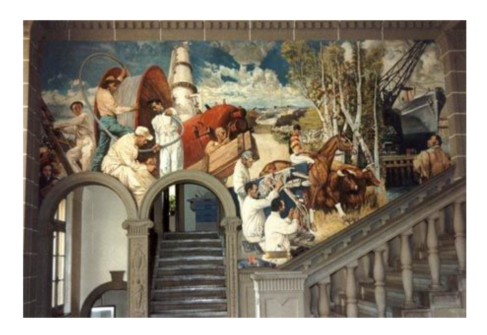
Irish Industrial Development (oil on wood panels) by Seán Keating (1961) International Labour Offices (ILO) Geneva, Switzerland (Positive images of Irish workers by Irish artist in Geneva – must be Socialist Realism!)