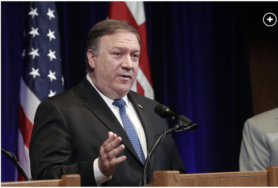
Mike Pompeo

Video: Pompeo Before Senate Foreign Relations Committee