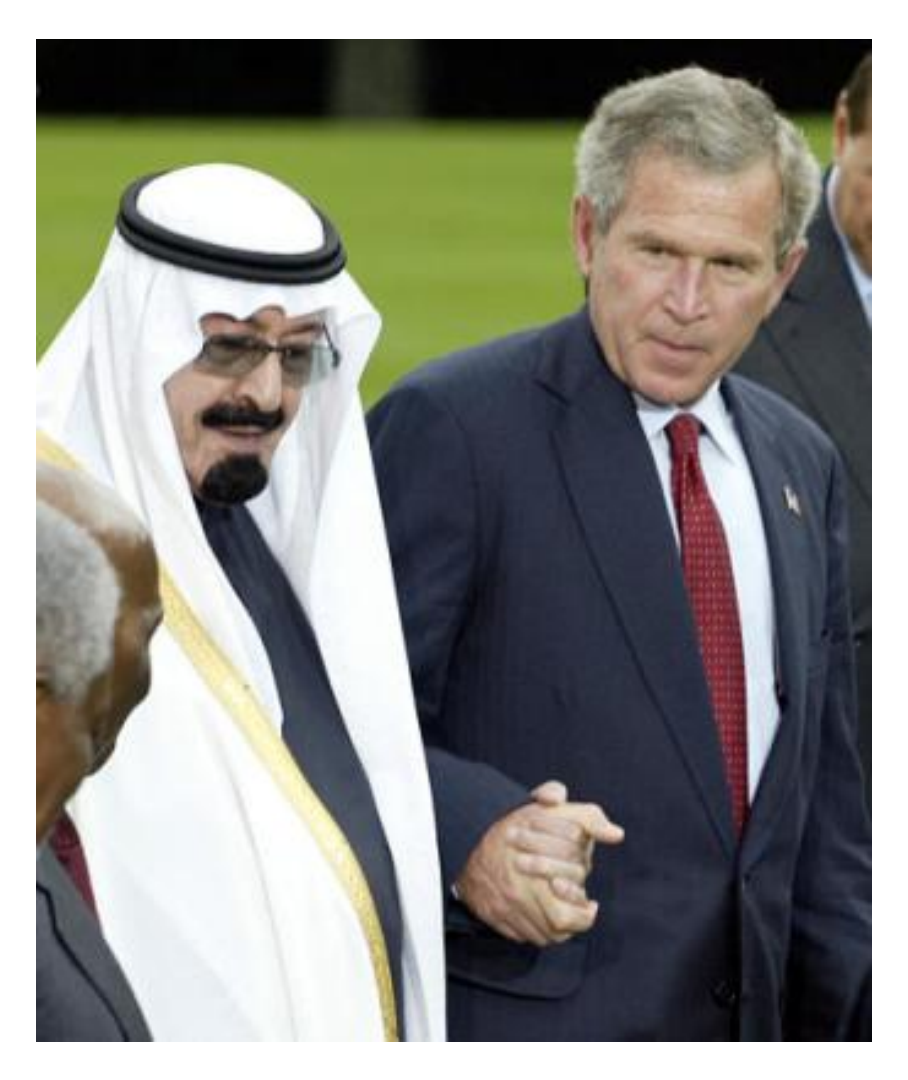
The Global War on Terrorism's "New Normal": "Good Guy" Terrorists

Establishing political ties with "State sponsors of terrorism" is now considered to be part of a "New Normal", a humanitarian endeavor intent upon spreading American democracy Worldwide.