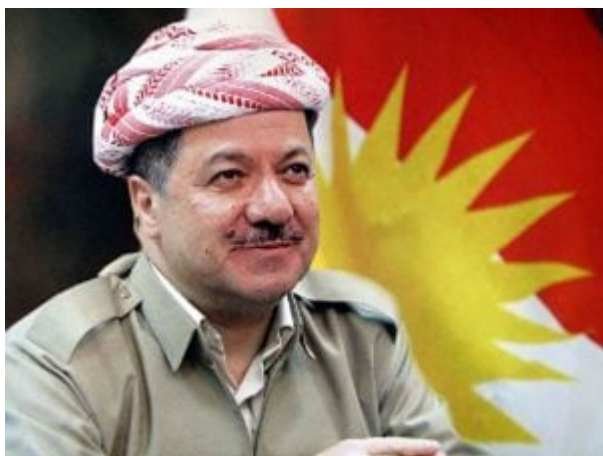
Masoud Barzani

Regardless of how their geopolitical future unfolds, it can be certain that the Kurds have already wised up to their ultra-strategic role in the world vis-à-vis the Great Powers and neighboring states, and it's condescending to imply that their people and especially their demagogic decision makers have yet to recognize this enduring century-long mainstay of International Relations. It's certainly the case that the Kurds' leaders regularly mislead their people and abuse their “messianic” dream of “Kurdistan” within the highly diverse transnational KCS, but this also provides them with a backup “insurance plan” to rely on whenever it fails by “playing the victim” of a conspiratorial “betrayal” by a “trusted ally” for soft power purposes and to consequently prompt an outpouring of sympathy from their domestic and international supporters. It's also an expedient means to deflect any responsibility for the disasters that they cause in pursuit of this goal, but nowadays that trend might be changing as the Kurdish people figure out that they're being manipulated by their own leaders more than by any foreign power.