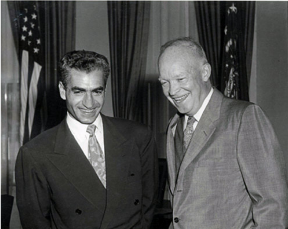
Shah Mohammad Reza Pahlavi and President Dwight D. Eisenhower, (undated photo).

In 1989, the State Department released what purported to be the official record of the coup period but it made not a single reference to American and British actions in connection with the event. The omission led to the resignation of the chief outside adviser on the series, and prompted Congress to pass legislation requiring “a thorough, accurate, and reliable documentary record” of U.S. foreign policy. After the end of the Cold War, the CIA committed to open agency files on the Iran and other covert operations, and the State Department vowed to produce a “retrospective” volume righting the earlier decision.