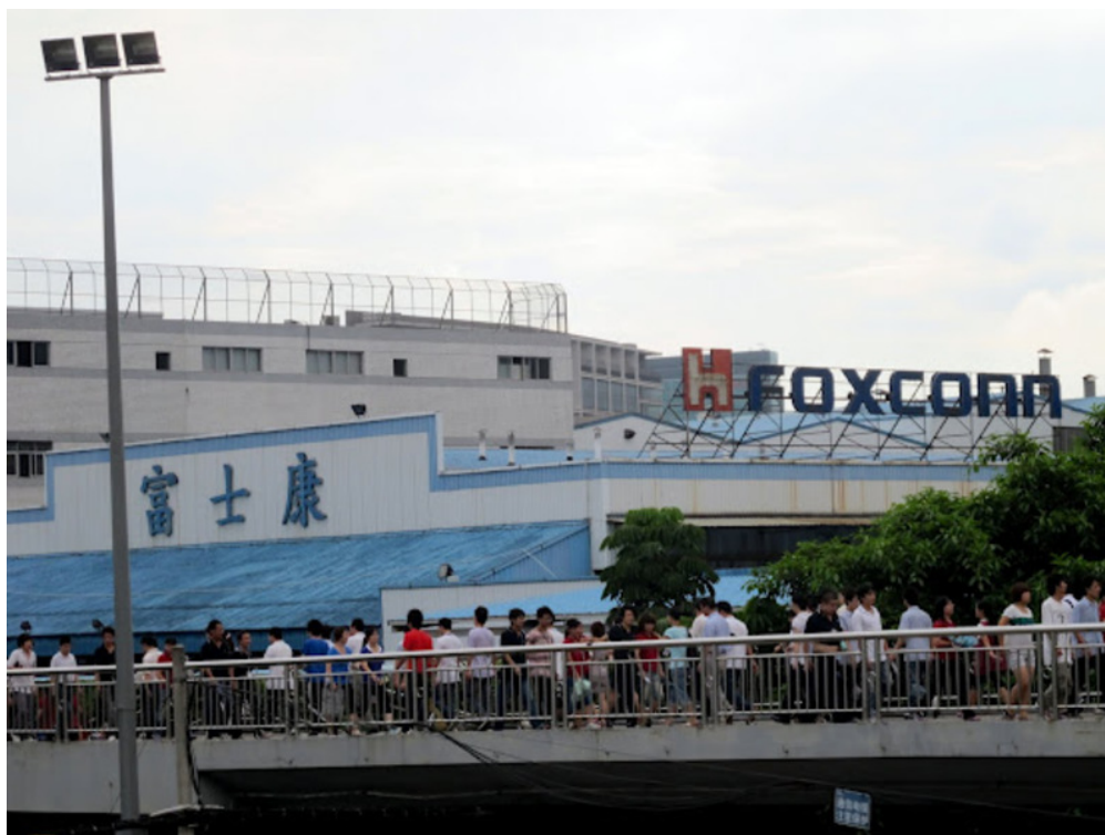
Image: The majority of Foxconn's more than one million workers are rural migrants and teenage student interns. Fushikang, headquartered in Taipei (registered as Hon Hai Precision Industry Company), literally means "wealthy" and "healthy" in Chinese. Photographs taken during field trips to Guangdong and Sichuan (2011-2014).

Our primary research is based on multiple fieldtrips to Foxconn's largest assembly facilities in Sichuan (Chengdu City) and Guangdong (Shenzhen City) between 2011 and 2012, and follow-up visits in Shenzhen in August 2014, supplemented with inquiries made to senior company executives between December 2013 and April 2014. 1 Drawing on interviews with 38 interns and 14 teachers, who were dispatched from eight vocational schools (based in Sichuan and Henan provinces) to Foxconn factories for internships, we also conducted documentary analysis of the Henan government's major policies on student internships and employment. There has been scant scholarly attention to student interns as temporary or contingent labor, leaving unexamined an important dimension of the precarity of Chinese labor that is the product of the triangular relationship linking capital, the local state, and vocational schools in internship programs. In the following we review the changing labor market and ongoing legal reforms and structural transformation in China. We then present the findings of our study of the Foxconn internship program, and conclude by assessing the corporate and government responses to student labor abuses.