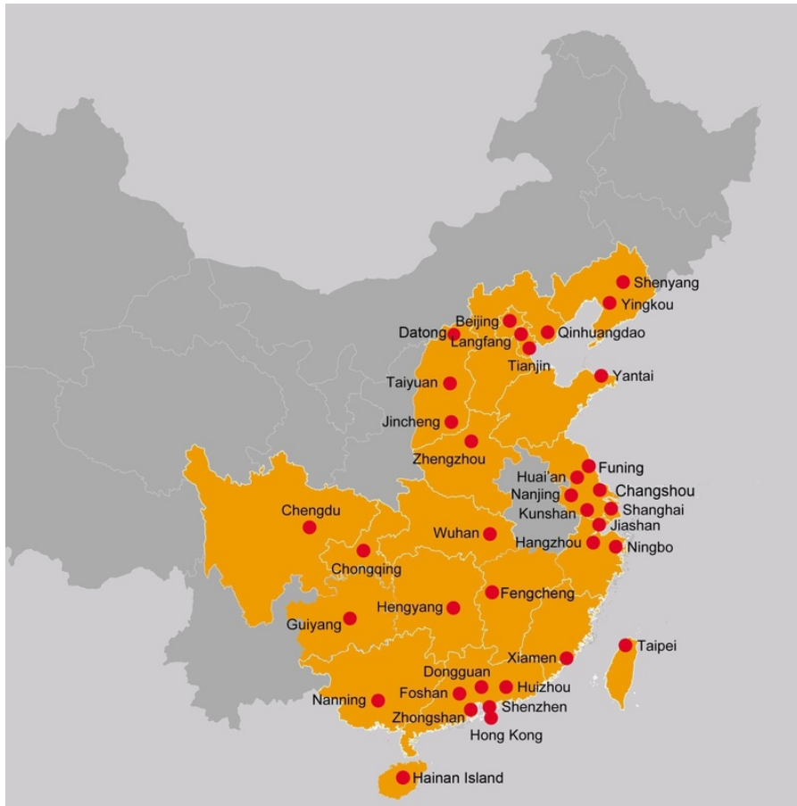
Image: Foxconn locations

30-plus manufacturing mega-complexes across China (see Figure 1), workers and student interns toil day and night to churn out iPhones, iPads, and other electronic products for Apple and other IT corporations. Following Chinese government stimulus-led growth and economic recovery, as well as large-volume orders, in 2010, Foxconn registered a 53 percent year-on-year increase in revenues to US$95 billion (3 trillion NTD) (Foxconn Technology Group 2011, 4). Student interns, among assembly-line workers, played an indispensable role in corporate expansion.