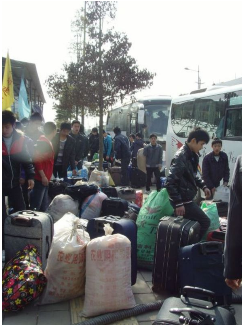
Image: Sichuan Zhongjiang Vocational School students, many of them 16 years of age, arrived at Foxconn (Chengdu) in the morning on 3 March 2011 to begin “internships.”