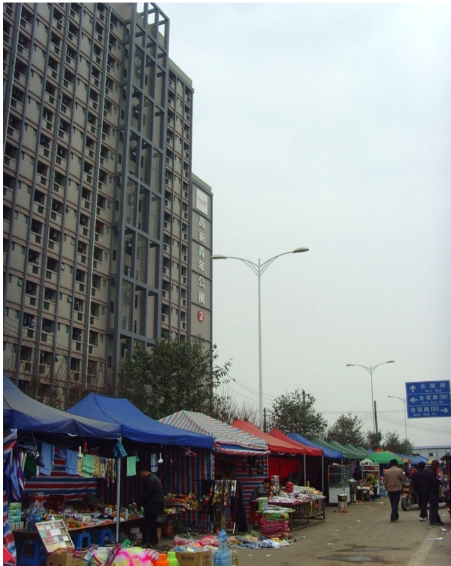
Image: Foxconn Chengdu's newly built 18-story factory dormitory, Block 2. Teachers are housed in dorm rooms next to their students to strengthen control during the off-work hours throughout the “internship.”

The duration of the Foxconn internship programs we studied during fieldwork in 2011 and 2012 ranged from three months to one year. From the beginning of her internship, Liu Siying 3 , the final-year student aspiring to a meaningful learning opportunity whom we met at the opening of this article, was “tied to the PCB [printed circuit board] line attaching components to the product back-casing.” In her words, “it required no skills or prior knowledge.” Students were assigned to a one-size-fits-all internship at Foxconn factories, which involved repetitive manual labor divorced from their studies and interests.