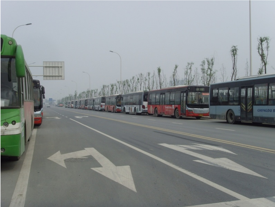
Image: 50-seater public buses line up for Foxconn (Chengdu) in Pi County, Sichuan. Drivers provide transportation service to Foxconn at government discounted rates.