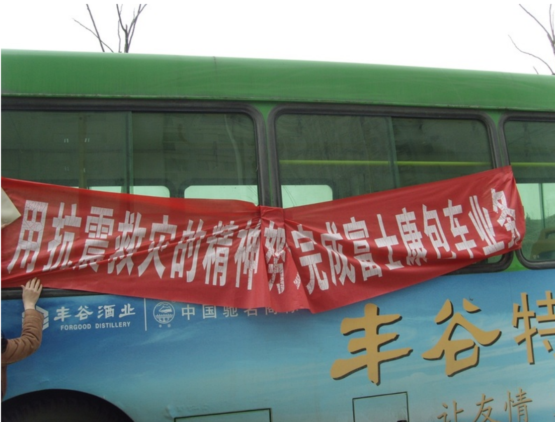
Image: Government-printed banners on the sides of the buses read, "Use fighting spirit to overcome earthquakes and natural disasters to provide transportation for Foxconn."