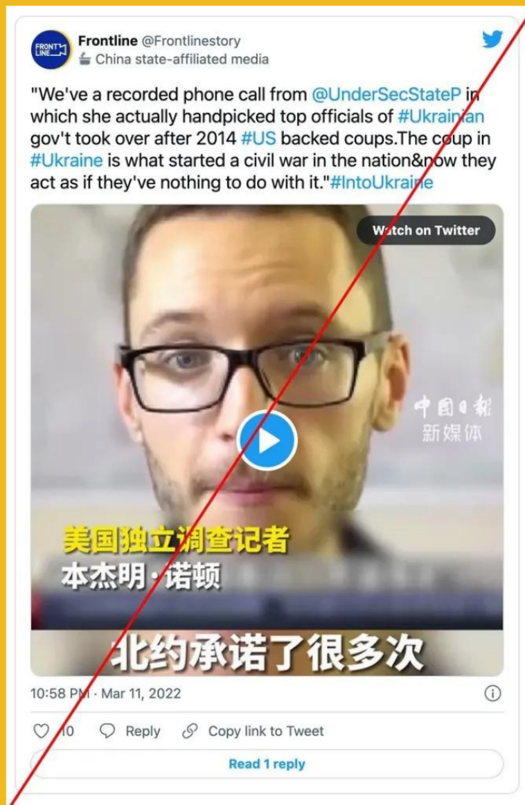
An image shared in the NYT hit against Norton.

The invasion of Ukraine has also raised a number of troubling questions for Western anti-war figures: How to oppose Russian aggression without providing more political ammunition to NATO governments to further escalate the conflict? And how to critique and highlight our own governments' roles in creating the crisis without appearing to justify the Kremlin's actions? Yet this new perilous media environment raises a further quandary: How to express views online without being censored?