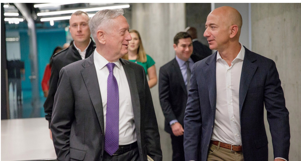
Jeff Bezos meets with Trump Defense Secretary James Mattis during a visit to west coast tech and defense companies.