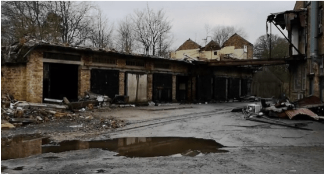
The partially demolished address at Gateside Mills.