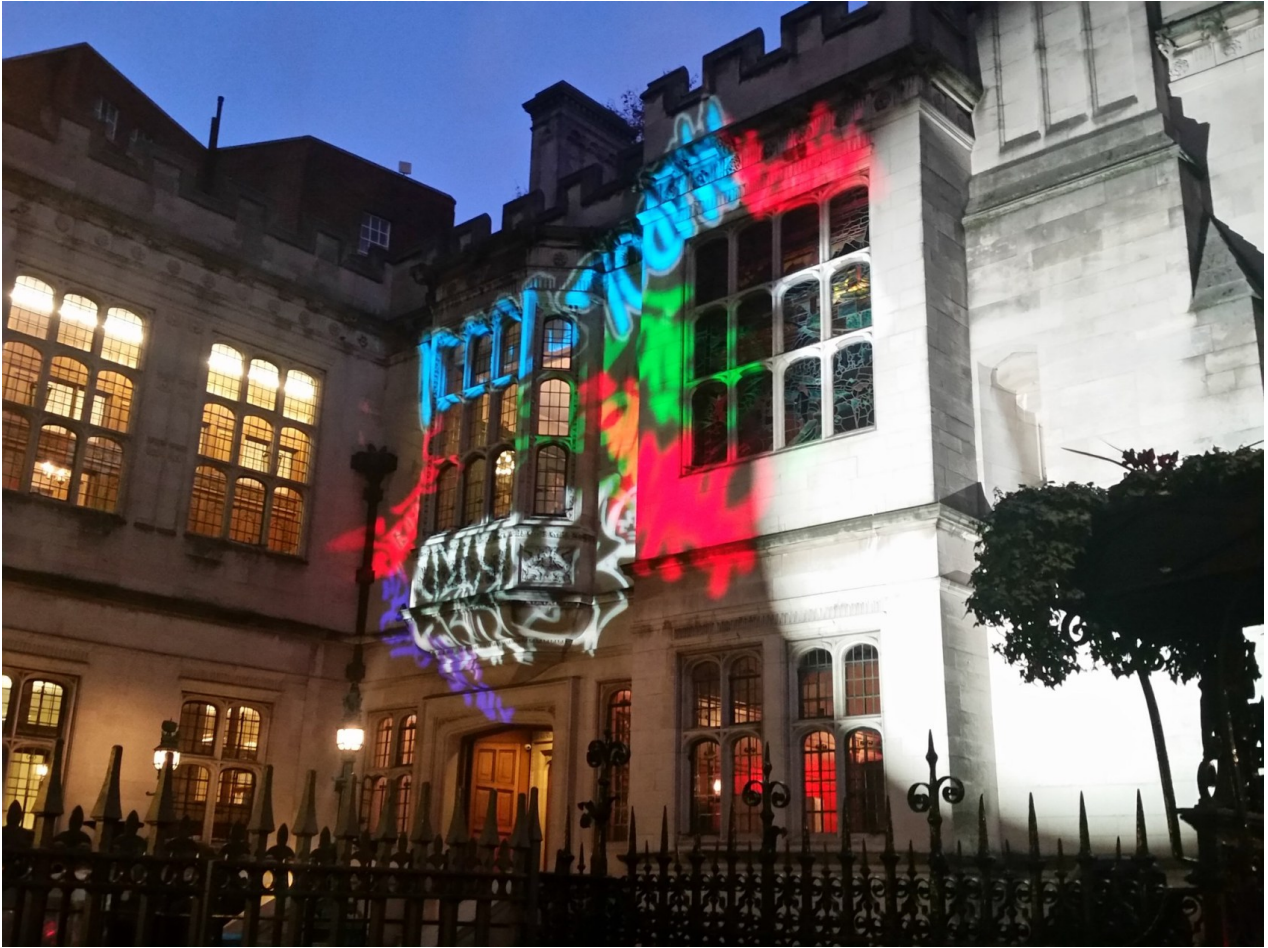
A Christmas themed projection lights up the walls of 2 Temple Place.

Elmaazi found the offices on December 6, having nearly given up and becoming convinced that he would discover nothing more than was found at the derelict house in Fife. When he arrived at the location, preparations were underway for some sort of Christmas-themed event to be held in the main building on the ground floor. But upon discovering the signs pointing downstairs to the basement, Elmaazi found himself staring at a door with a sign that read, "The Institute for Statecraft / The Fore."