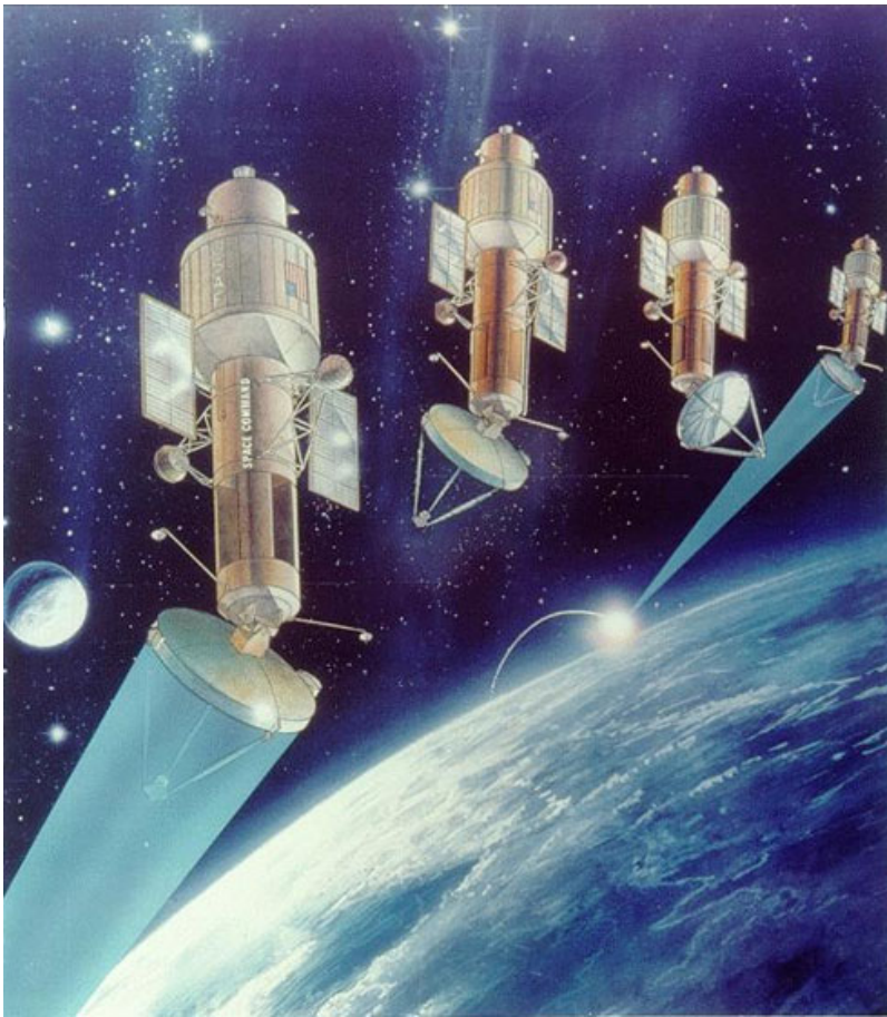
“Rods from God” weapon system.

The above scenario looks increasingly plausible given a) the growing prospect of war between the U.S. and China; and b) the growing militarization of space by the U.S.—in violation of the landmark Outer Space Treaty of 1967 that sets aside space “for peaceful purposes.”