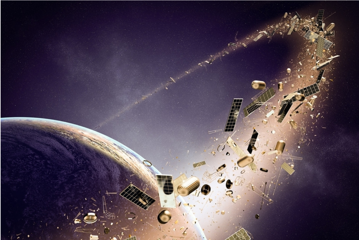
Space junk.

“We have reached the point in human history where we need the immediate intervention by the citizen taxpayers of the planet to ensure that our tiny orbiting satellite called Earth remains livable for the future generations,” Gagnon declared. “We can’t fall for the public relations story-line of the cowboy sailing off into space to discover the new world. We know how that movie turns out in the end—just ask the Native American people.”