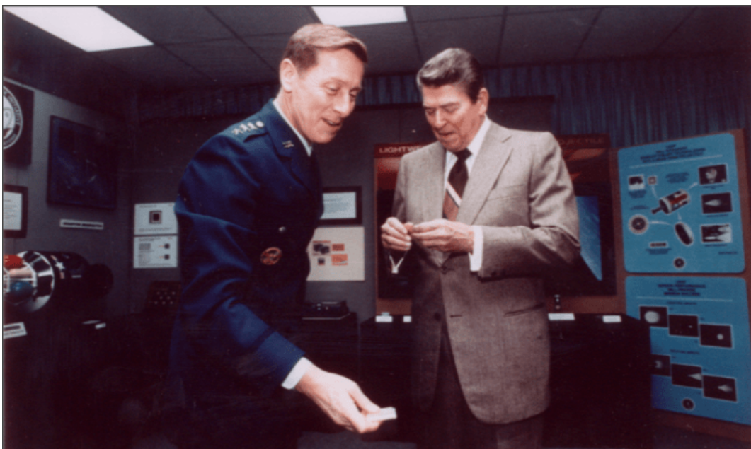
Lt. Gen. James Abrahamson and President Ronald Reagan at Strategic Defense Initiative Labs.

A 1996 U.S. Air Force report, New World Vistas: Air and Space Power for the 21st Century , speaks of how "new technologies will allow the fielding of space-based weapons of devastating effectiveness to be used to deliver energy and mass as force projection in tactical and strategic conflict. These advances will enable lasers with reasonable mass and cost to effect very many kills."