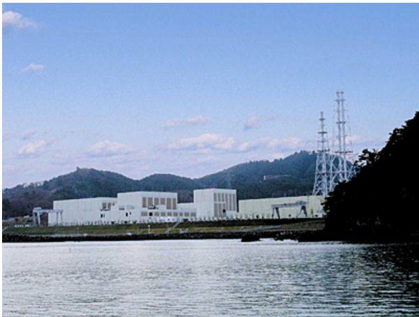
Image: The Onagawa Nuclear Power Plant