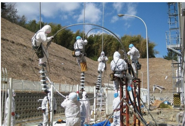
Image: Tepco subcontract workers